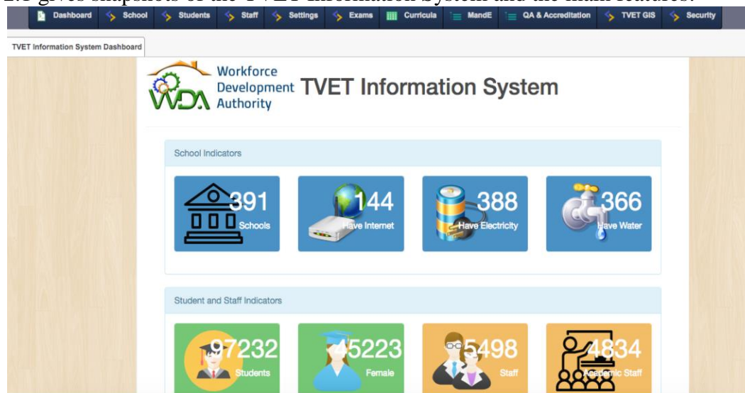
Figure 2.1: Snapshot of Dashboard

Figure 2.1 gives snapshots of the TVET Information System and the main features.