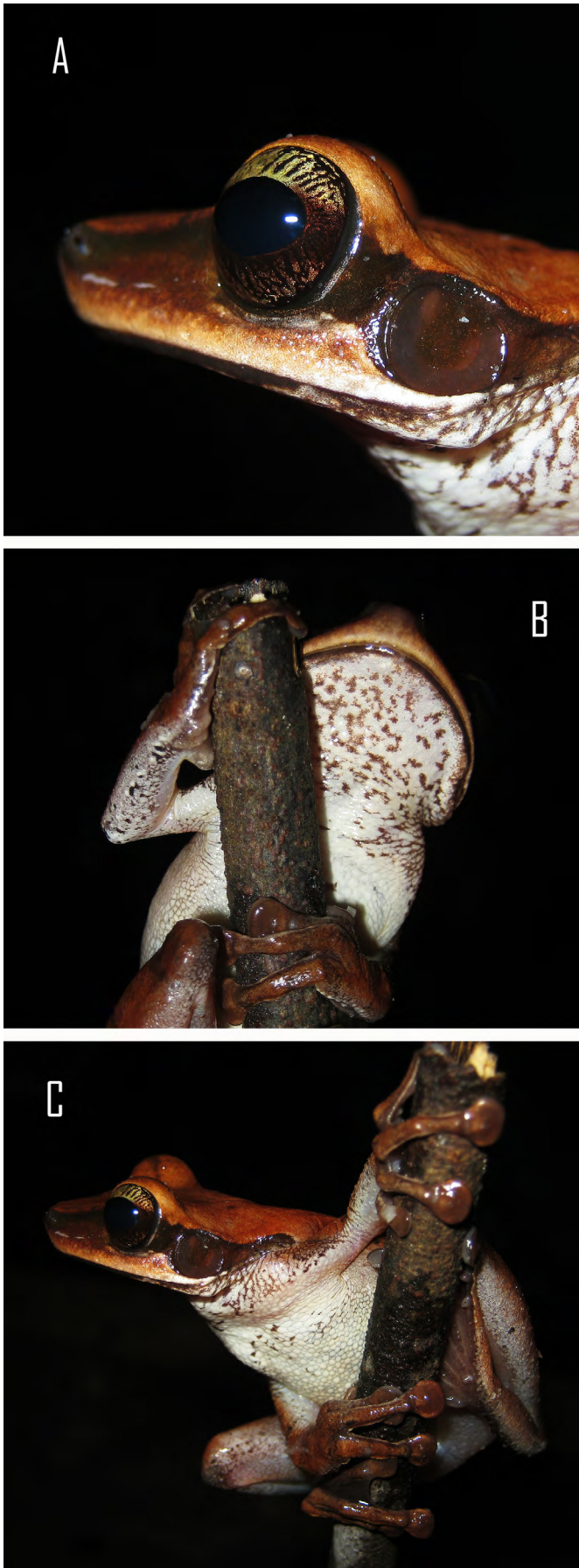
Figure 1. Osteocephalus castaneicola (55 mm SVL) collected in Estação Ecológica do Cuniã, state of Rondônia, Brazil (UFRO-H 3107). (A) Iris bicolored with a dark horizontal stripe, golden above, bronze below, both parts with fine dark reticulate to radiate lines, (B) A narrow dark line along the mandible and (C) Ventral surface.