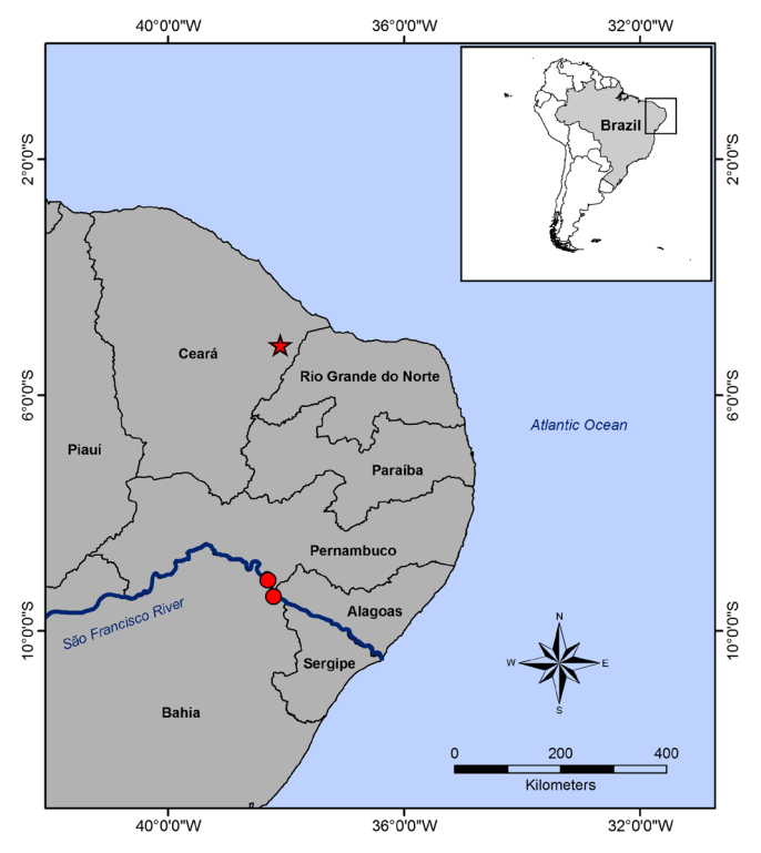
FIGURE 1. Distribution of Chthonerpeton arii . Star = type locality, municipality of Limoeiro do Norte, state of Ceará, Brazil; upper circle = UHE Itaparica, border between states of Bahia and Pernambuco, Brazil (approx. 09°08' S; 38°18' W; 270 m elev.); lower circle = municipality of Paulo Afonso, state of Bahia, Brazil (approx. 09° 22' S; 38° 13'W; 235 m elev.).

distribution in Brazil, occurring in water bodies in the Caatinga biome: temporary ponds at the type locality; in a river and in a fish breeding station in our new locality records. Collection of more specimens will be needed to improve the knowledge of it species.