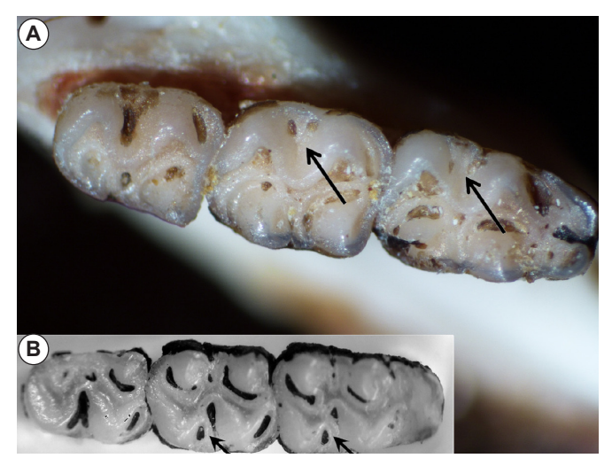
FIGURE 2. (A) Lower left molar row of Juliomys rimofrons (MN 77793), with arrows indicating the absence of ectolophid/ectostylid on m1 and m2. (B) Lower right molar row of Juliomys ossitenuis (MZUSP 33171), with arrows indicating the presence of ectolophid/ectostylid on m1 and m2; modified from Costa et al. (2007).

Even with these new records, J. rimofrons can still be considered as a rare species in zoological surveys (Bonvicino and Geise 2008), probably occurring at low abundances in non-volant small mammal communities and difficult to capture with conventional live-traps, resulting in few collected individuals and absence of data for this species.