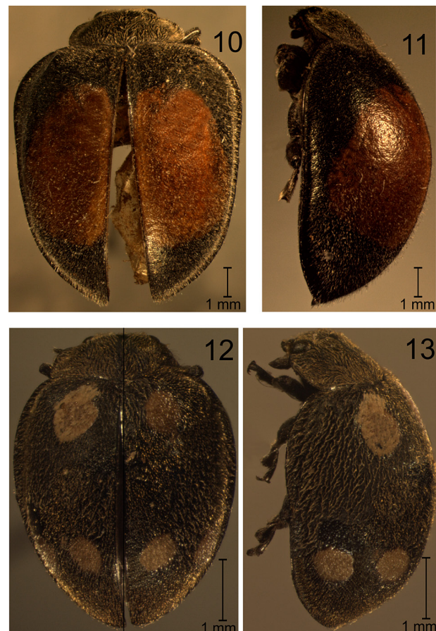
Figures 10–13. Females, Toxotoma guerini and Epilachna bistriguttata . 10, 11, T. guerini : (10) dorsal habitus; (11) lateral view. 12, 13, E. bistriguttata : (12) dorsal habitus; (13) lateral view.

The typical locality of T. guerini is located in the biogeographic province of Rondonia or Pantanal (Amazon