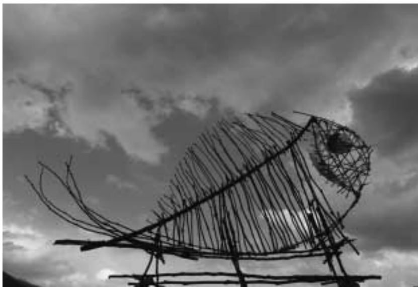
A series of 'fossil' sculptures composed of interlaced branches and sheet-metal, positioned in the meadow by lake Capriati al Volturno, culminating with The Fish , 15 m × 5 m

'hiss of history', the project seeks to elaborate new prospects for the interpretation of local experiences and their worldly connections. 4 The project will deploy experimental communicative techniques that integrate more traditional communication with the new media, producing documentary, artistic and cultural transpositions of the problematics that connote the territory. Interviews, filmed conversations, written testimonies, photos and physical memorabilia will be integrated with diverse analyses (geographical, historical, anthropological, sociological, etc) in the elaboration of a hypertextual database – Fluid Archive for Mobile Landscapes – that will contribute to a critical perception of both the past and the present which is accessible from any computer terminal on the planet. The principal characteristic of this 'fluid archive' is that it is readable from multiple points of view, offering diverse trajectories through the archive. As an open and stratified series of 'maps', composed of a diversity of elements and languages (geographical, linguistic, social, economical, oral, photographic, musical...), it permits a multiple and open-ended composition of the locality, potentially producing a shifting series of interacting interpretations.