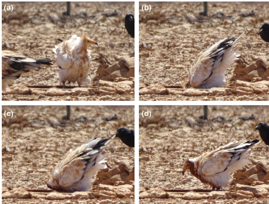
FIG. 2. Photo composition showing the painting behavior of an Egyptian vulture in the mud bowl on Fuerteventura. (a) Birds entering the bowl are usually very wary and concentrated and in most occasions first start to carefully scratch the mud with their legs (see text for more details) after which they swipe both parts of the head in the mud (shown in panels (b) and (c)). Depending on the intensity of mud bathing the head, neck and chest feathers usually get a very rufous coloration (d), thereby greatly changing the general appearance of the bird.

restricted to certain sex- or age-classes and was performed by both adult males and females (three and five individuals, respectively — one unknown sex), immature birds (age 1–3 yr) of both sexes (four males, two females, one unknown sex) and two recently fledged young.