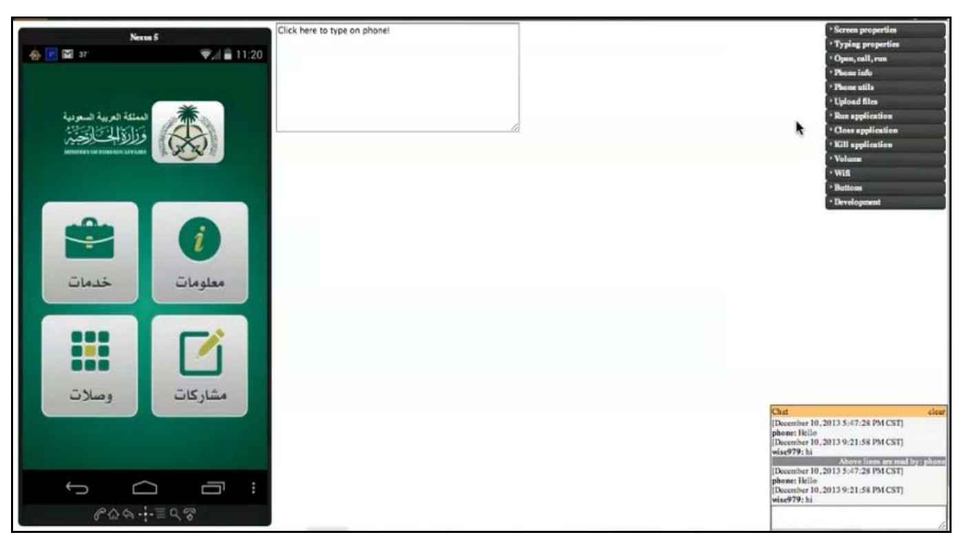
Fig. 1 Shows the tested phone on the computer's screen.

Applications that are designed to one group of users were used in order to make the reliance on the rating given to the three applications more accurate. Furthermore, government applications were selected since the researchers believe that no one would be interested to change the rating of those applications.