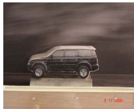
Fig. 7 Model 2