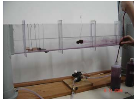
Fig. 6 Water of tunnel