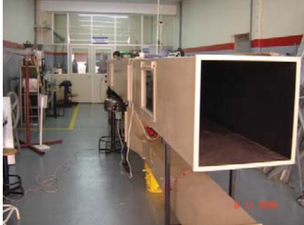
Fig. 1 Aerodynamic Air Tunnel

thickness of the wall of the cells between 0,5 and 2,0mm. The beehive was built starting from tubes of PVC that were cut with 200mm of length each one. Those parts were mounted and agglutinated, forming 625 cells of square section 50x50mm. In Fig. 2, the final assembly of the beehive.