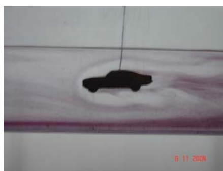
Fig. 12 Text Model 4

In a streetcar, the sustentation should not harm the aerodynamic efficiency, for they are obtained larger acting and smaller consumption.