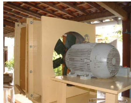
Fig. 5 Centrifugal fan