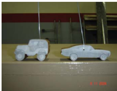
Fig. 8 Models 3 and 4