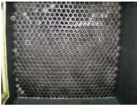
Fig. 2 Box of harmonization of the type beehive

After the diffuser, the drainage suffers an acceleration, due to the presence of a contraction in which the drainage suffers a pressure loss, that is, turns into kinetic energy (speed) that goes to the rehearsal section. The whole construction of the structures of the tunnel (diffuser, contraction, rehearsal section), they were accomplished by techniques used by [17]. Parts as: The box of harmonization of the drainage; the cooker hood to retain the coming vibrations of the motor and the helix of the motor for generation of the wind, technical were accomplished used at the Laboratory of Aerodynamics. Figs. 3 and 4 show a view of the Pitot tube, the Fig. 5 presents the centrifugal fan used in aerodynamic tunnel.