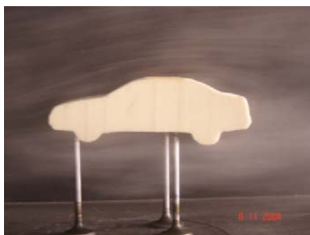
Fig. 9 Text Model 1

In the wind tunnel, it was possible to notice that the drainage of air through the model 1 (Fig. 9) finds smaller resistance than the model 2 (Fig. 10). This happens due to form of the model 1 to be aerodynamic, produced minor I drag and turbulence formation.