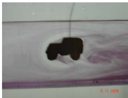
Fig. 11 Text Model 3

In the automobile branch, the aerodynamics is factor of highest importance that will contemplate later in the acting of the automobile, as economy or stability.