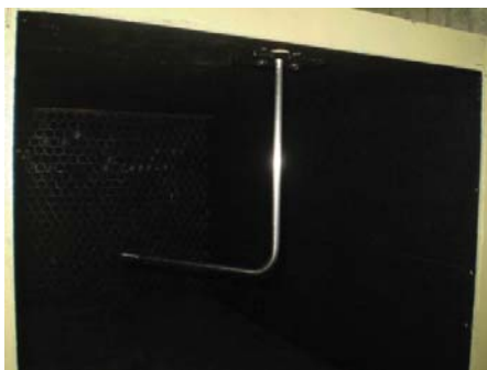
Fig. 3 Pitot tube

After the diffuser, the drainage suffers an acceleration, due to the presence of a contraction in which the drainage suffers a pressure loss, that is, turns into kinetic energy (speed) that goes to the rehearsal section. The whole construction of the structures of the tunnel (diffuser, contraction, rehearsal section), they were accomplished by techniques used by [17]. Parts as: The box of harmonization of the drainage; the cooker hood to retain the coming vibrations of the motor and the helix of the motor for generation of the wind, technical were accomplished used at the Laboratory of Aerodynamics. Figs. 3 and 4 show a view of the Pitot tube, the Fig. 5 presents the centrifugal fan used in aerodynamic tunnel.