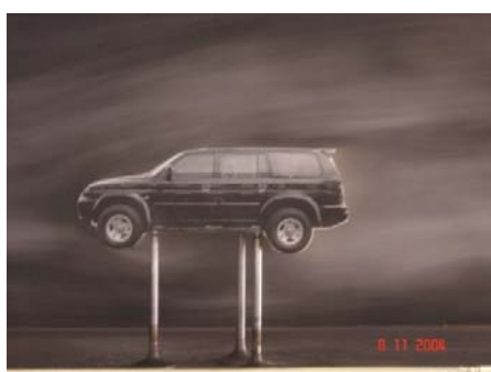
Fig. 10 Text Model 2

In the water tunnel, it is observed that the model 4 (Fig. 11) has an upper aerodynamic to model 3 (Fig. 12) due to formation of less turbulence and production of least resistance. In the same way that the model 4 in relation to the model 3, this "better aerodynamics" of the model 4 is due to the fact of possessing a closer form of a "wing" and a smaller front area.