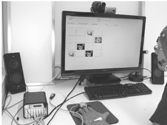
Fig. 3 Experimental Setup

For the realization of the wizard-of-oz Experiment it was necessary to split the setup in two rooms, one with the stimulus-PC for the subject (see Fig. 3) and one manipulation-PC for the wizard in another room. The picture presentation in the first half of the experiment was conducted in the same room.