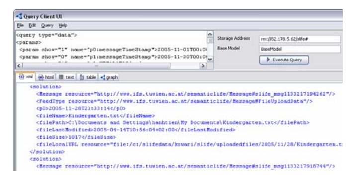
Fig. 3. An example of a VQL query

The VQL aims at supporting the user in generating queries according to their nature: minimum of words, maximum of information . The VQL defines the virtual query operators and they allow the user to simplify the complex queries: