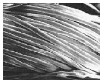
Fig. 2 Scanning electron microscopy of Ammonyx with treatment