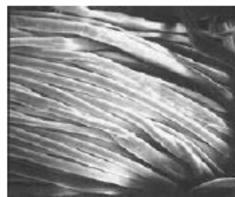
Fig. 1 Scanning electron microscopy no treatment