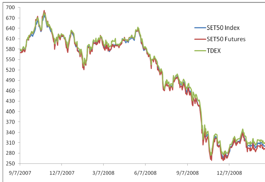
Fig. 2 Time series of the SET50 index, SET50 futures, and TDEX from September 2007 to February 2009