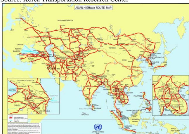
Fig. 2 Asian highway route map