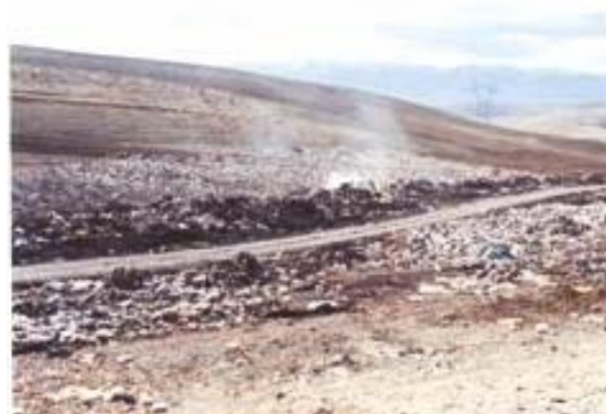
Fig. 8 Wastes disposal around the road and waste burning in landfill site

Some obvious problems of this site are as follows: