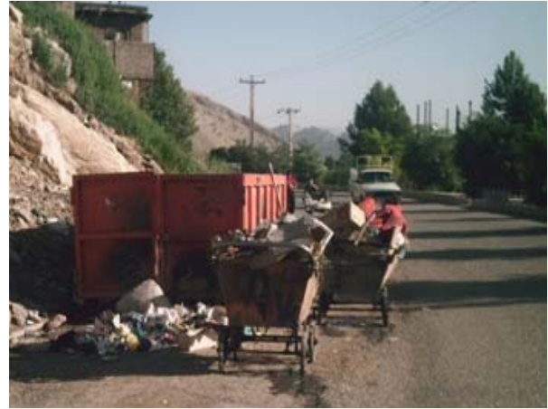
Fig. 5 Temporary terminal for collection solid waste

Local Authority (KhoramAbad Municipality) is responsible for waste collection, transportation and street sweeping. Municipality is responsible for waste collection, using private sector contracts.