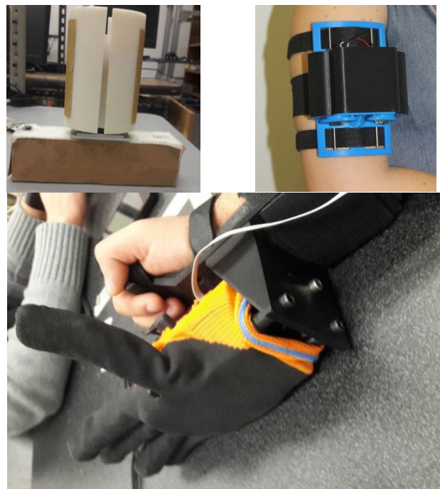
Figure 1. Clockwise from top left: the inverted-T sensorized object, the CUFF, and the SoftHand Pro with the forearm adapter.

One method of delivering sensory information is “modality matching,” or producing a sensation in the user similar to the type of information to be transmitted. We previously explored providing grasp force (pressure) information using a pressure cuff-type device [9]. The device