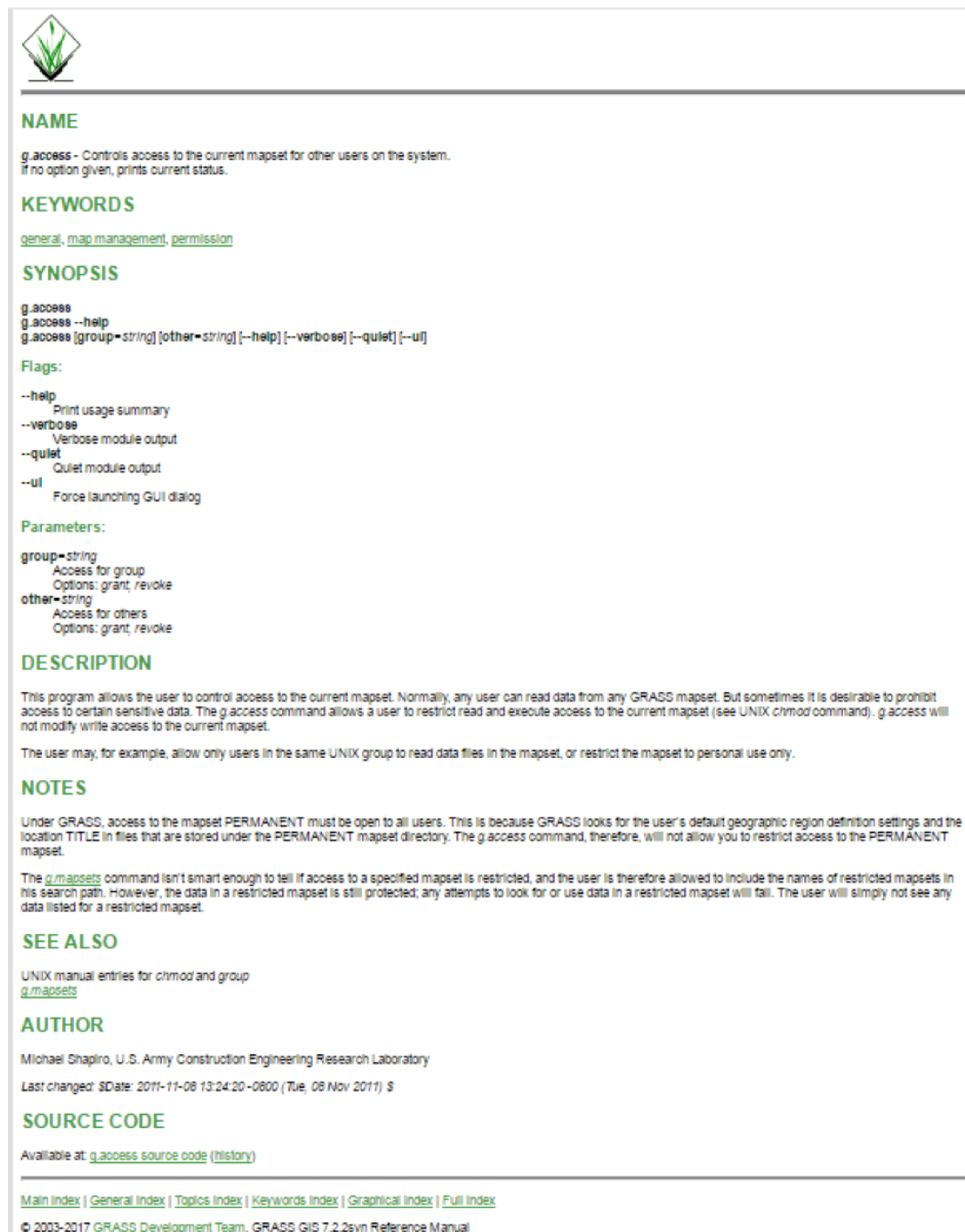
Figure 1: Example of a GRASS GIS standardized manual page for a module (g.access module).

This type of manual page can also serve as a landing page for a DOI, including a high level description, metadata, and links to the recent source code and previous versions. The module is an example for code which has been maintained by the project community for a long time after the original developer left the project (GIS 2017).