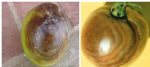
Figure 17. Brown concentric rings caused by buckeye rot on tomato fruit.

The initial symptom on the fruit is a grayish green or brown watersoaked spot that usually appears near the blossom end, or at the point of contact between the fruit and soil [28]. The spot further enlarges and develops into a lesion with a characteristic target-like pattern of concentric rings of narrow dark brown and wide light brown bands that resemble the markings on a buckeye (Figure 17) [29]. Fruit symptoms caused by buckeye fruit rot can be confused with symptoms of “late blight,” which is caused by the fungus Phytophthora infestans [30]. Buckeye fruit rot lesions are at first firm and smooth surface and lack a sharply defined margin, whereas late blight lesions are typically rough and sunken at the margins. Buckeye fruit rot may produce a white, cottony fungal growth on the lesion under moist conditions (Figure 18) [31]. The buckeye rot fungus can affect both green and ripe fruit. Diseased fruit are usually located nearest the ground in staked tomatoes.