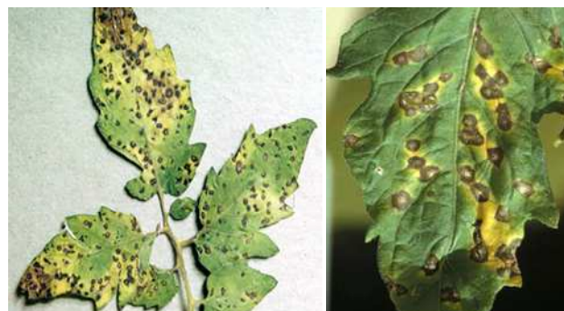
Figure 6. Septoria tomato leaf spot; the light-colored centers.