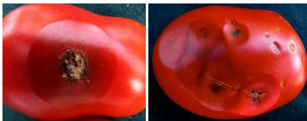
Figure 15. Fruiting bodies at the center of the lesion on ripe tomato fruit.