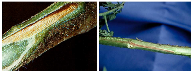
Figure 11. Vascular browning caused by Fusarium wilt on tomato stem.