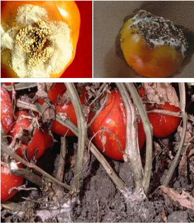
Figure 21. Mycelia and sclerotia of Sclerotium rolfsii on tomato fruit.

After sclerotia germinate, the fungus must first colonize organic debris near the soil surface before the fungus can cause infection. Early symptoms on fruit are circular water-soaked spots followed by soft rot or decay (Figure 21).