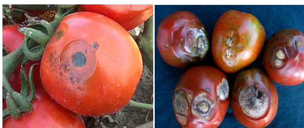
Figure 16. Anthracnose tomato fruit rot.