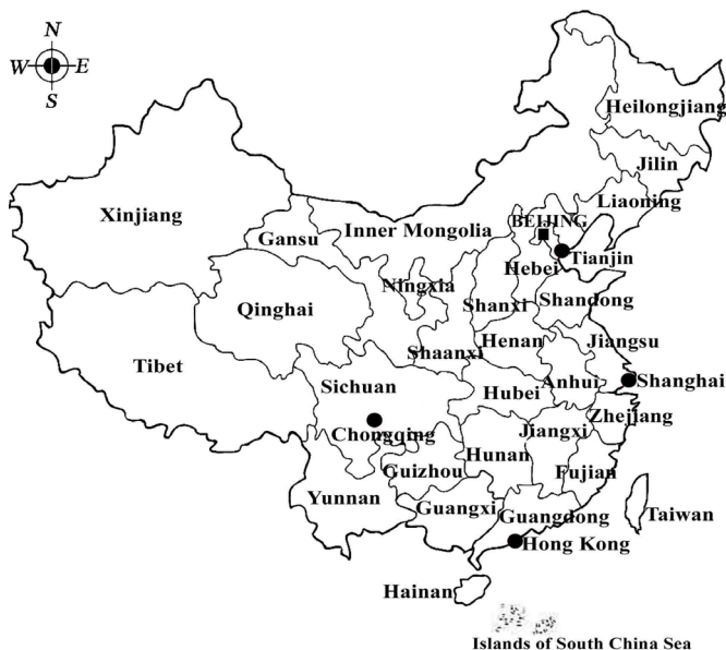
FIGURE 1. Map of China, showing its provinces.

Thysanoptera have a diversity of biologies, i.e. predators, phytophagous, and fungus-feeding. All members of Aeolothripidae, species of Scolothrips (in Thripidae) and several species of Phlaeothripidae, such as Haplothrips kurdjumovi and H. subtilissimus (in Phlaeothripidae), are predators; several recorded species in Phlaeothripidae are fungus-feeding; but most others feed either on leaves or on flowers of plants, many being important pests, such as species belonging to the genera Haplothrips , Stenchaetothrips , Taeniothrips , Dendrothrips , Megalurothrips , Anaphothrips , Thrips , Frankliniella , Scirtothrips , Microcephalothrips , and Ceratothripoides . Amongst them, species of the five latter genera are pests of agricultural crops and flowers, either by direct damage caused to plant tissue during feeding or by transmission of pathogenic agents, especially viruses.