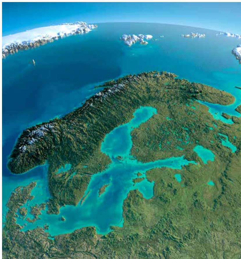
As the Baltic Sea is a shallow basin mostly filled with brackish water, it suffers from eutrophication, toxic blue-green algae blooms, and oxygen deficit, all of which have an impact on the community.

“Our plan is specifically to study reconstruction, that is, how DNA and RNA data