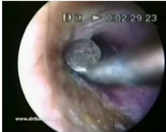
Elevation of tympanomeatal flap (Endoscopic view)

Bony overhang area could be clearly seen without any problem.