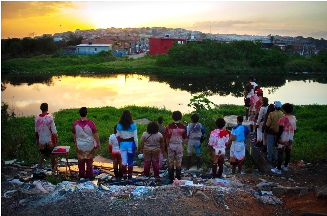
Fig. 3 ' The city of invisible rivers ' – last scene.

' The city of invisible rivers ' - the last of the trilogy - had more interaction with different artists and residents. It is an itinerant performance four hours long that starts at a central train station, carried out on a train for around forty minutes, then continuing through the Jardim Romano and finishing at the river.