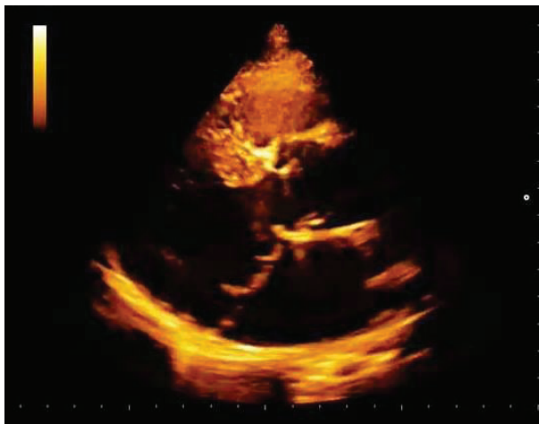
Figure 3: 2DTT echocardiogram shows a classical billowing of bileaflets MVP

and was then lost in the follow up with filed practice not having delivered the required tests.