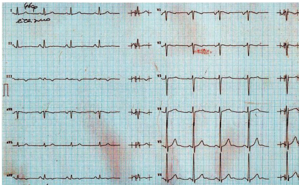
Figure 1: Resting ECG shows negative T waves in the inferior limb leads