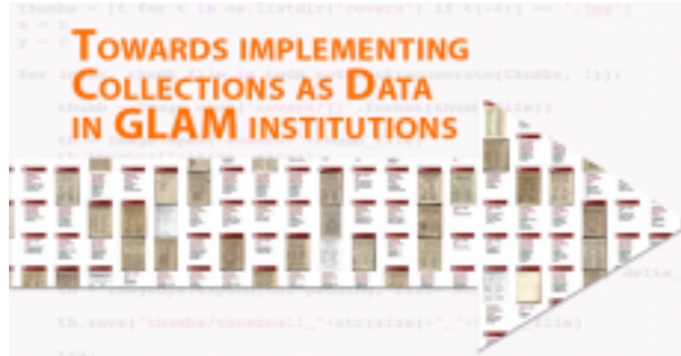
Fig 1. Webinar presented in collaboration with the International GLAM Labs Community. 1 1 https://glamlabs.io/events/collections-data/

GLAM institutions are exploring new ways to show researchers how to reuse the content of their digital collections. In addition to the dedicated websites, Labs, data repositories and documentation (e.g., README files), Jupyter Notebooks have emerged as a powerful tool to provide documentation and code that can be run in cloud environments without the need to install additional software. 2 In this sense, we have designed a framework to extract digital collections as Collections as data that include the use of Jupyter Notebooks and has been applied to a wide diversity of digital collections made available by GLAM institutions [6].