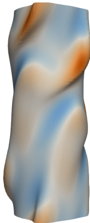
e) Ra = 3550