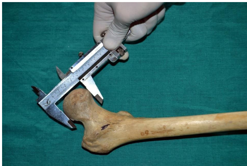
Fig No. 2:- Showing the measurement of Femoral Head Diameter of with the help of vernier caliper.