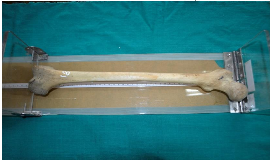
Fig No. 1:- Showing the measurement of Femoral Length on osteometric board.

It is the distance from highest point of femur head to the lowest point of medial condyle. It will be measured by placing the femur on to the osteometric board and recorded in centimeter (cm).