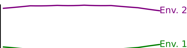
Prob. of Env. 1 Position