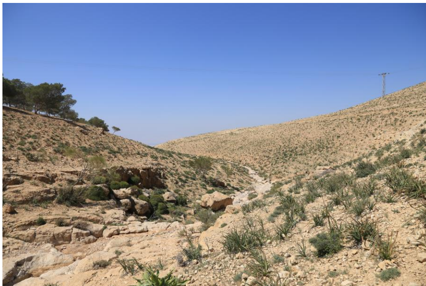
Figure 21. Ph. (M.) p. vladyslavi ssp. n. : Type locality.