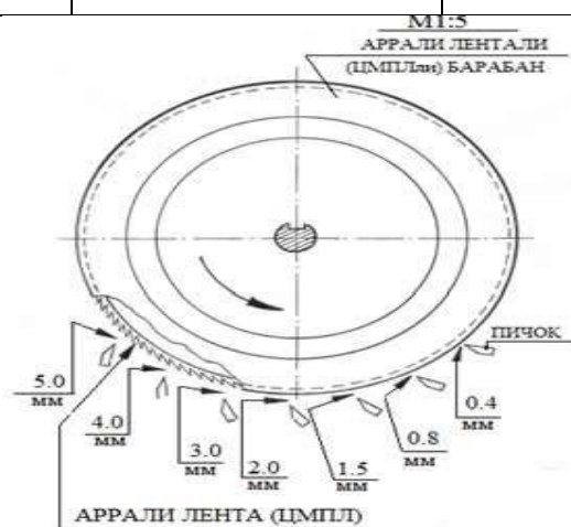
2 – rasm. Paxta chiqindilari tarkibidagi yigiruvga yaroqli tolalarni ajratib oluvchi qurilmani.