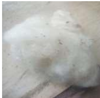
Ulyuk tarkibidan ajratib olingan tola

Qo'yilgan vazifani xal qilish maqsadida chiqindi tarkibidagi yigiruvga yaroqli tolalarni ajratish qurilmasini yaratishni maqsad qilib olindi. Buning natijasida korxonada tola chiqish miqdori oshadi va yaxshilanadi. Qurilmani taklif qilishdan maqsad chiqindi tarkibiga qo'shilib ketayotgan uzun tolalarni ajratib olib, korxonada tola chiqishi miqdorining oshirish va uzun tolalarni chiqindi tarkibiga qo'shilib ketishini oldini olish orqali chiqindi tarkibidan tola ajratib olishdan iborat.