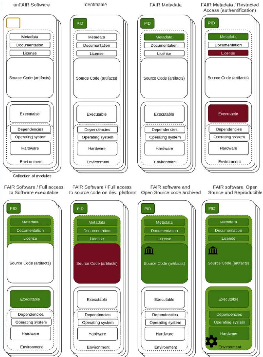
Figure 2: Summarizing software as increasingly FAIR research objects (Katz, Gruenpeter & Honeyman, 2021)

Commented [340]: I don't think this figure was referenced in the text