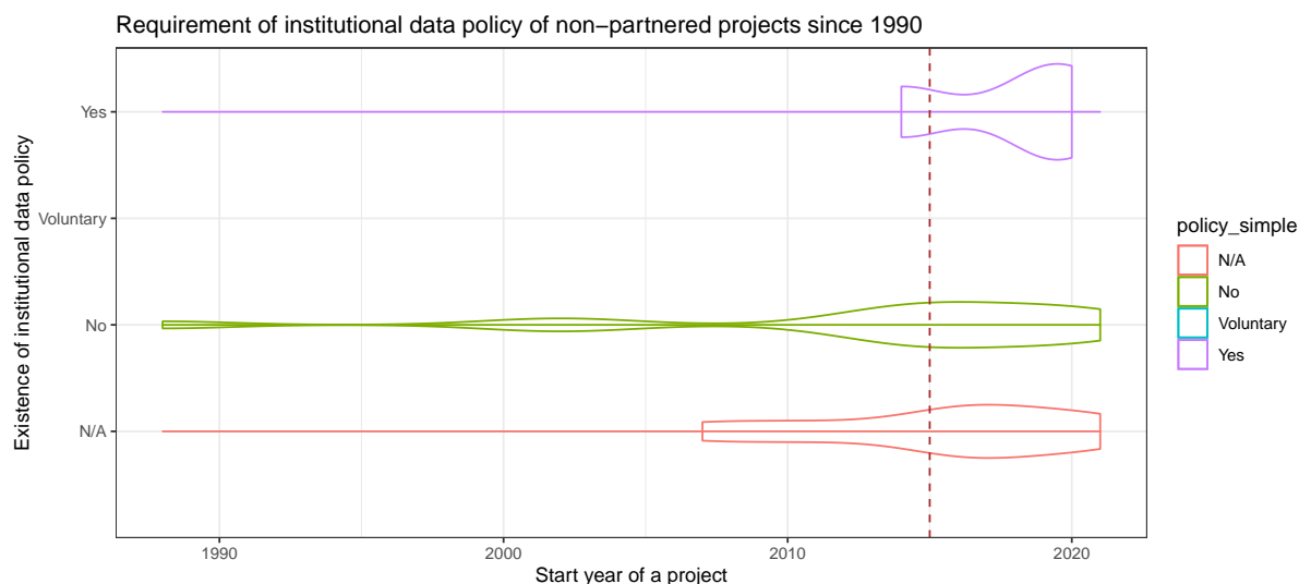
Figure 1: The chart shows the existence of institutional data policy of non-partnered projects and its development over time.

The main factor influencing the need to comply with institutional principles seems to be the age of the project - for projects created in recent years (e.g. since 2015), we would expect FAIR data policies to be one of conditions for securing funding. In order to verify this hypothesis, we collected additional information manually from project websites and published materials, such as the official project start-date, the country of origin of a given project, indications of existing funding and primary focus of a given project (text publication or metadata collection). The anonymised data is saved as a TSV in the same GitHub repository as /data/02_scoping_survey_anonymised_PostSurvey.tsv .