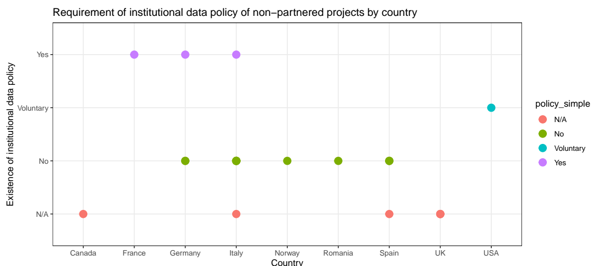
Figure 2: The chart shows the requirement of institutional data policy of non-partnered projects by country.

Figure 2 above shows clear geographic differences in implementation of data policies based on the main country where the project is based. France, Germany, and Italy are listed as countries where data policies are required, yet some projects in Germany and Italy answered that no data policies are required. Thus the practical implementation of data policies may depend on the particular funding agency or institution, rather than on nation-wide policies. We are well aware that data policies might be different for projects funded from other sources than national or European research council schemes, where such requirements may not be compulsory. Our results are only preliminary and based on a very small sample and need to be confirmed by further and more detailed investigation.