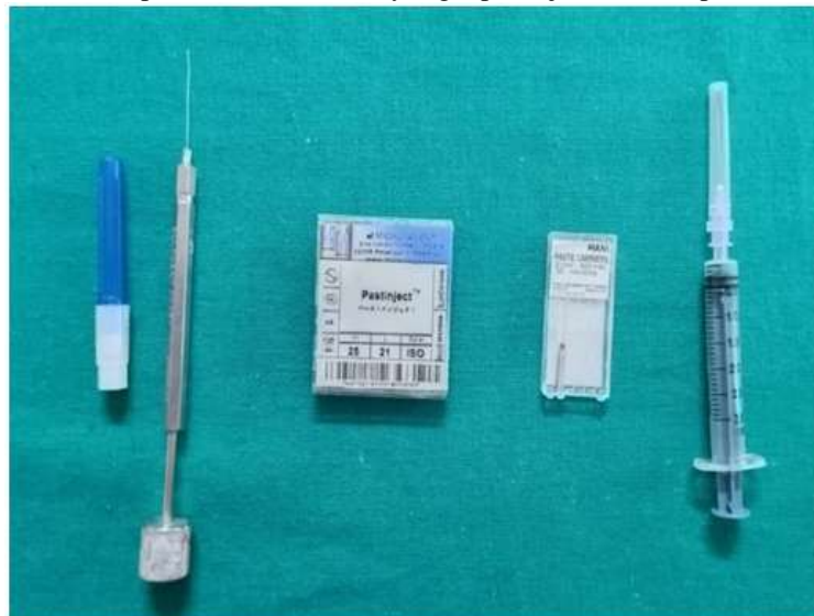
Fig 2:- Endodontic pressure needle and syringe, pastinject, lentulospirals, LA syringe.

Based on technique of obturation, it was divided into 4 groups. (fig :2)