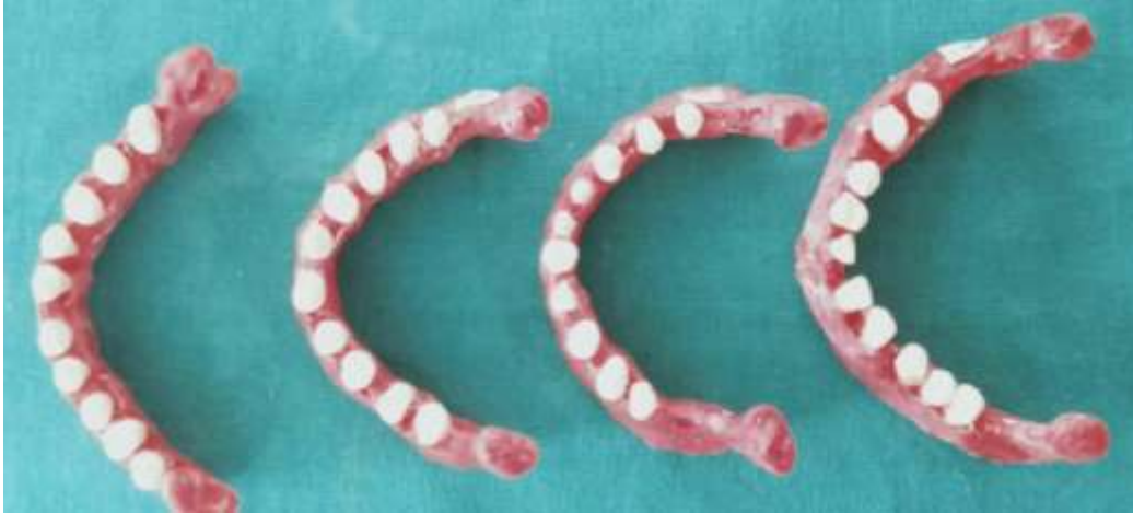
Fig 1:- wax pattern with samples.

A model of “U” shape was made using modeling wax. Four of such models were made such that it mimicked the natural arch form of human jaw. To these, U shaped arch specimens on which prepared samples were embedded such a way that the root was inside the wax while rest was exposed. Each arch contained ten teeth. (fig 1).