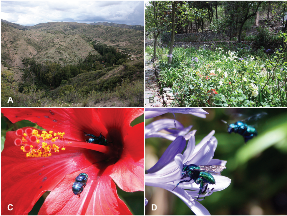
Figure 2. A San Joaquin close to Yotala in Chuquisaca department, surrounded by Eucalyptus (Myrtaceae) trees B garden in San Joaquin C Euglossa melanotricha Moure on flowers of Hibiscus rosa-sinensis L. (Malvaceae) D Exaerete dentata (L.) on flowers of Agapanthus praecox Willd. (Amaryllidaceae).

thus praecox Willd. (Amaryllidaceae) originate from South Africa (Mor et al. 1984) and Hibiscus rosa-sinensis L. (Malvaceae) is introduced from Asia.