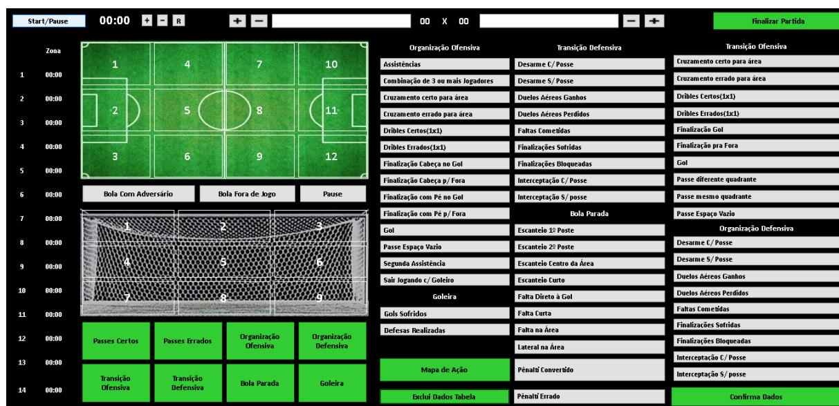
Figure 1 – HandScout software in the Portuguese version.

Figure 2 shows some of the main outputs that HandScout can generate.