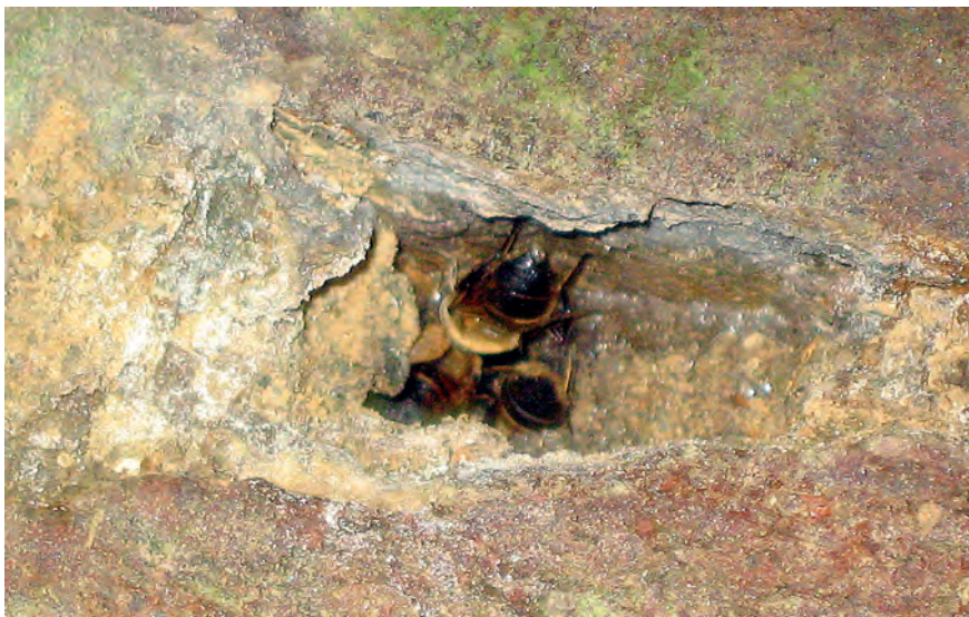
Fig. 2: Eristalis tenax at the locality Podhradí.