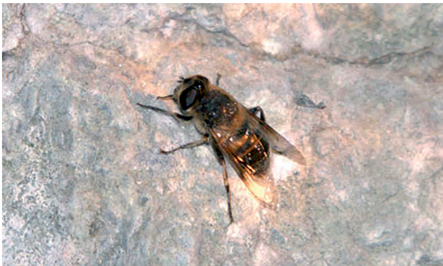
Fig. 1: Eristalis tenax at the locality Chanovec.

All specimens were found in small crevices (Fig. 2) except the locality Chanovec, where one ♀ was found sitting on the wall (Fig. 1).