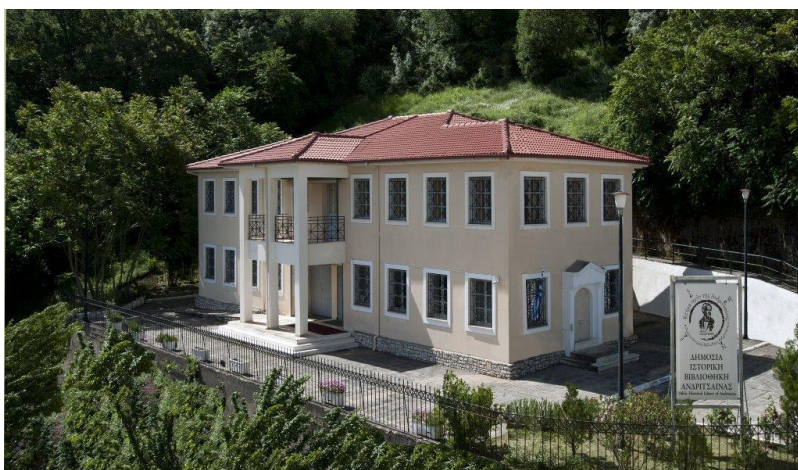
2. The building of Andritsaina's library