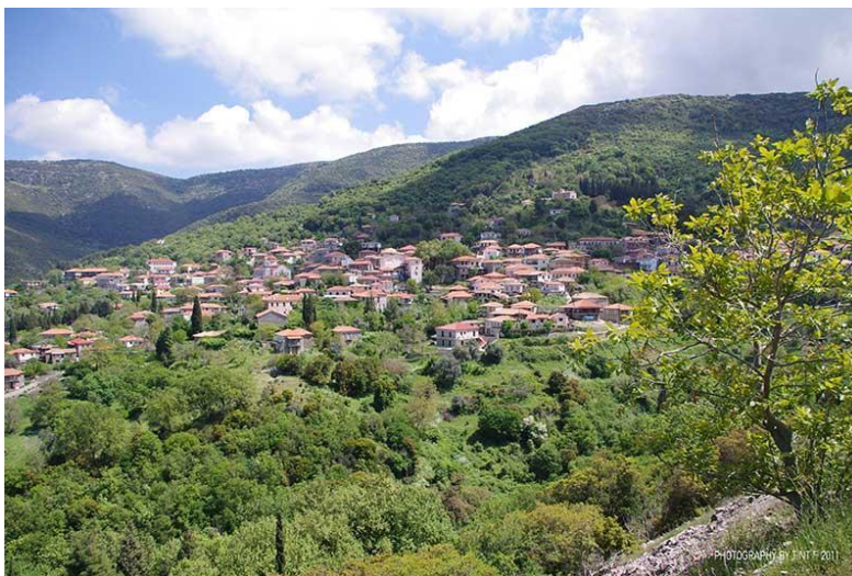
1. The mountainous village of Andritsaina

Indeed in 1879, inaugurated the Public Historical Library of Andritsaina also known as "Nikolopoulios", one of the richest and most important libraries in the country that houses the remarkable collections of K.Nikolopoulos, with rare versions of the early years of printing (such as the 1515 Pindar's "Victory Odes" edition), and E.Kallianiotis. It also includes an exhibition of plaster casts from the frieze of the Temple of Apollo Epicurius (donation from the British Museum in 1963), and a historical archive with manuscripts from the Greek Revolution and the post-revolution period.