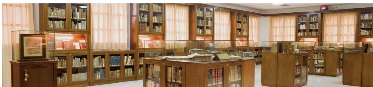
3. The indoors of the Public Historical Library of Andritsaina