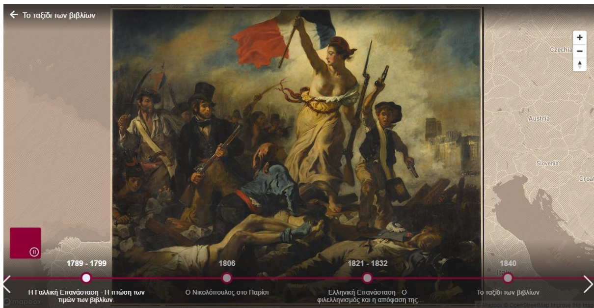
6. The timeline project detail refers to the French revolution