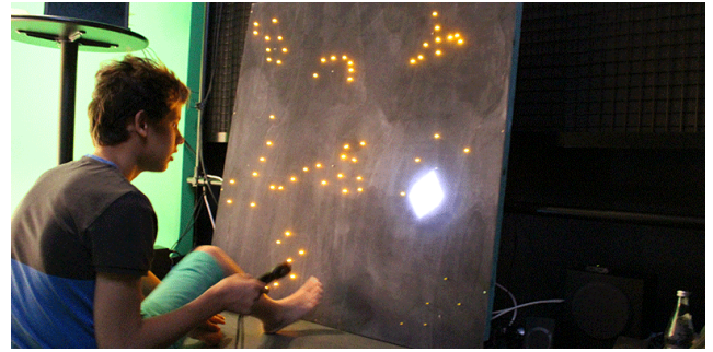
Figure 3: A child testing SnoeSky

To create congruency between sound and light intensity, the LEDs are driven through pulse width modulation controlled by the sound intensity using an envelope follower. Due to the limited current on the digital pins from Bela we use an external 15V/0,8A stabilized DC power supply for the LEDs. To close the circuit only when needed, a LR7843 transistor is combined with an optocoupler triggered by a digital output signal from Bela . The lights are set up in rows of 6 yellow LEDs each 12 , which are combined in series to form the constellation. If the number of LEDs of a constellation is not a multiple of 6, the row is completed with 120Ohm resistors replacing the missing LEDs (see figure 4.1). The photoresistor is connected to an analog pin of the Bela board through a standard voltage divider circuit. 13