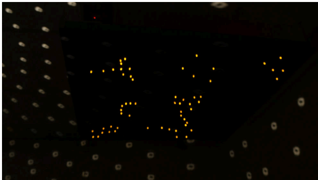
Figure 2: Final installation of SnoeSky

The interactive audio synthesis of the installation (see figure 2) implements a one-to-one parameter mapping in which the decaying envelopes of each of the eight voices are triggered through a photoresistor embedded into the wooden panel in the center of each constellation. The sensitivity of the photoresistors is adjusted to capture the beam of a small flashlight being held by a person lying on the bed below the panel. Each note sound is synthesised by a noise oscillator shaped into a pitched sound by a strongly resonating filter. Controlled by an envelope generator with a relatively short but smooth attack and a long release time, the emerging sound quality has a soft resonating timbre of ‘shining’ texture. This synthesis technique can be seen as a simple model of a resonator that is excited by a stroke. Other than repeatedly triggered sound samples, it results a lively sound quality with a relaxing effect that is well accepted by the users.