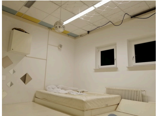
Figure 1: The Snoezel-Room

Apart from these questions we have been particularly attentive to the metaphoricity implied by the ADMIs’ setup and the afforded interactions. The goal was to create joyful and poetic environments that allow for positive and inspiring experiences. After a first selection of the most promising ideas based on sketches and mockups started a development period of several month.