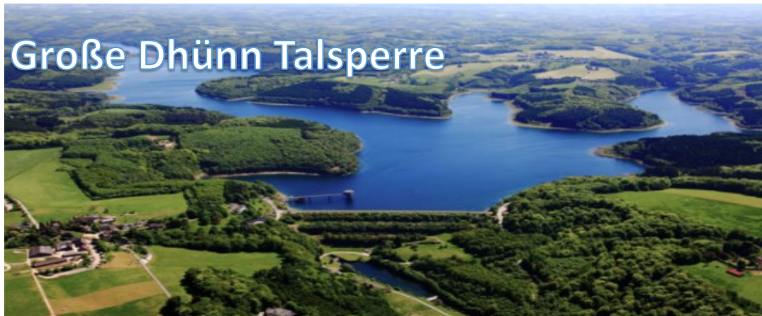
Große Dhünn-Talsperre