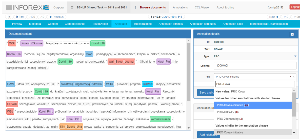
Figure 1: Screenshot of the Inforex Web interface, the tool used for data annotation.