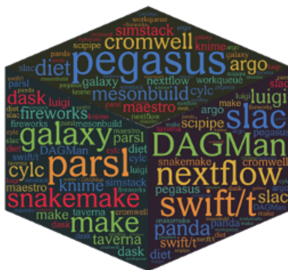
Figure 2: Word box of used WMSs obtained from the Community Research Infrastructure Survey.

For each of the themes shown in Table 2, the lead gave a plenary 5-minute lightning talk, highlighting the theme and its challenges (videos for each presentation can be found at the WorkflowsRI’s YouTube channel [7]). Each theme was then discussed in breakout sessions, with the lead coordinating the discussion and a shared document being used to capture notes and for asynchronous discussion. The goal of these sessions was to identify other challenges, if