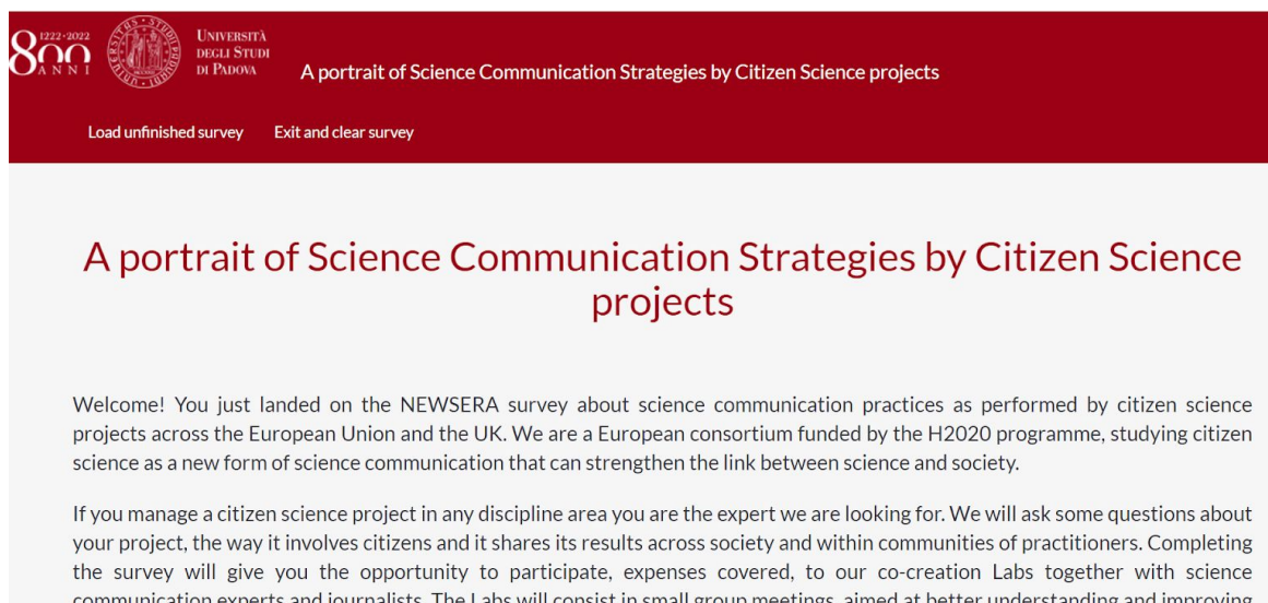
Figure 2: Page of UNIPD to directly access to the survey. Available at: https://websurvey.unipd.it/survey/index.php/816644?lang=en

The entire corresponding text is here transcribed, highlighting in bold the way to manifest the informed consent to participate in the survey .