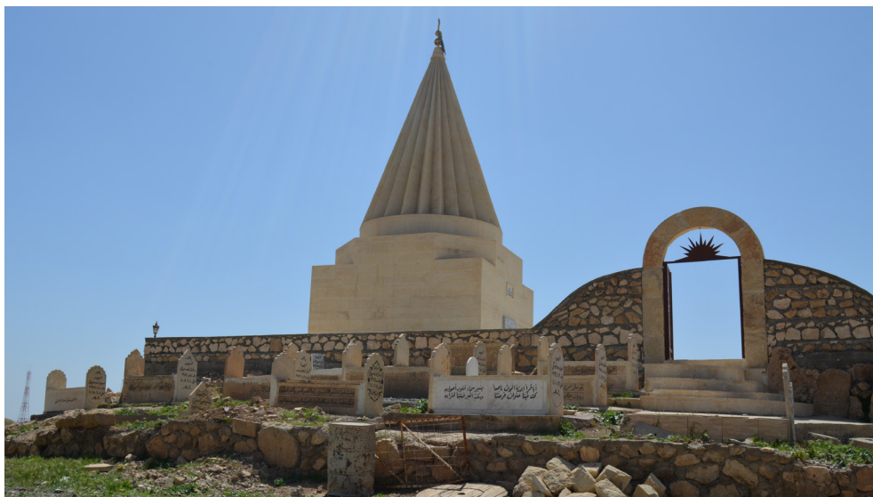
Figure 31b: The shrine of Mer Sjadeen post-reconstruction, April 2018