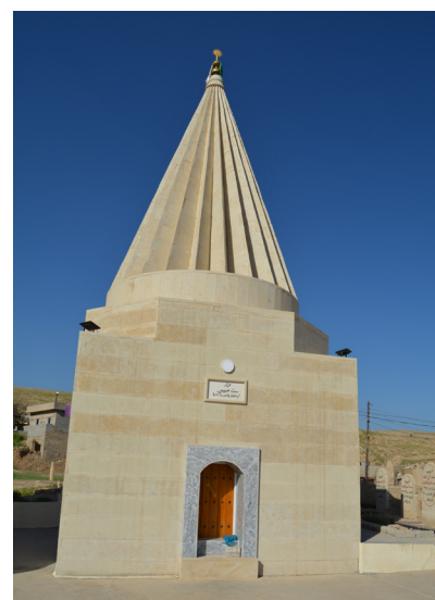
Figure 48b: The shrine of Stiya Habib post-reconstruction, April 2018