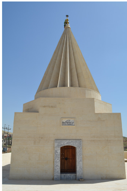
Figure 31a: The shrine of Mer Sjadeen post-reconstruction, April 2018