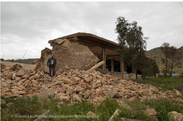
Figure 9a: The shrine of Sheikh Mand post-destruction, April 2017