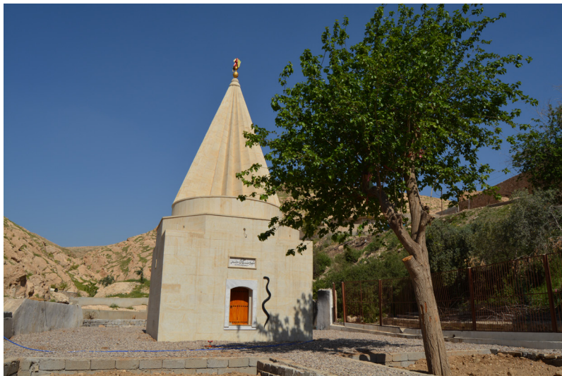
Figure 35a: The shrine of Sheikh Mand post-reconstruction, April 2018