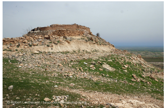
Figure 19b: The shrine of Mahma Rashan post-destruction, April 2017