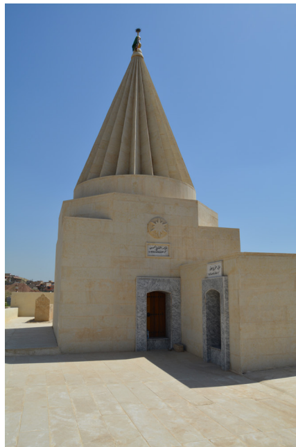
Figure 30a: The shrine of She'shems post-reconstruction, April 2018