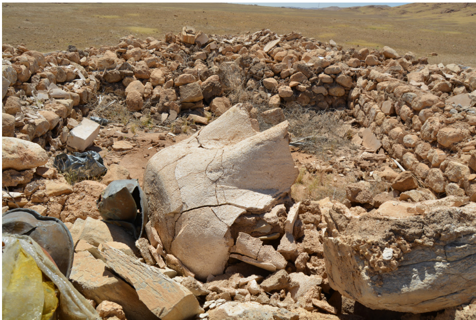
Figure 6b: The shrine of Sheikh Abdul Aziz post-destruction, June 2018