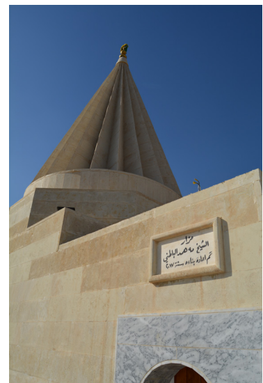
Figure 44b: The shrine of Mahamad Batin post-reconstruction, April 2018