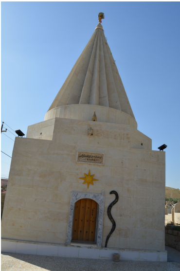
Figure 42a: The shrine of Sheikh Babek post-reconstruction, April 2018