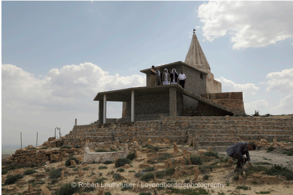
Figure 16a: The shrine of Mahma Rashan pre-destruction, October 2012