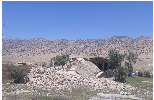
Figure 11b: The shrine of Sheikh Mand post-destruction, December 2018