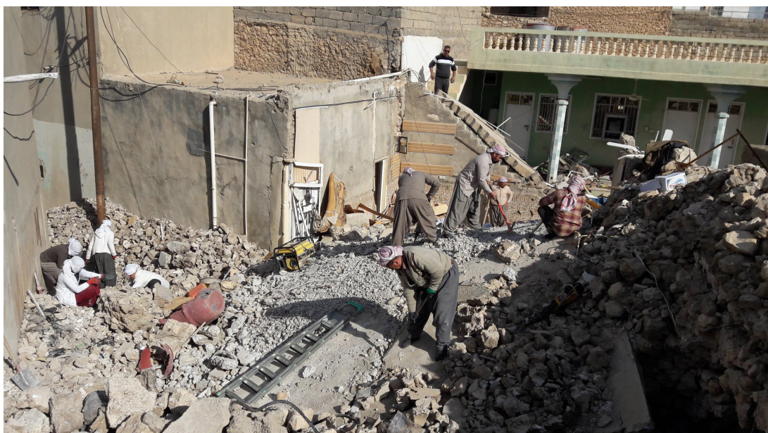
Figure 47: The shrine of Stiya Habib post-destruction, November 2016