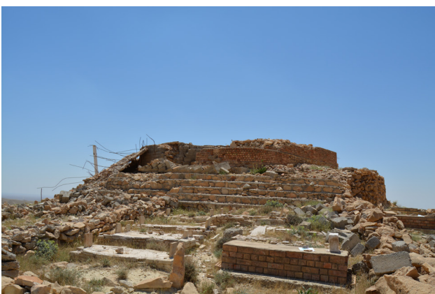
Figure 20: The shrine of Mahma Rashan post-destruction, June 2018