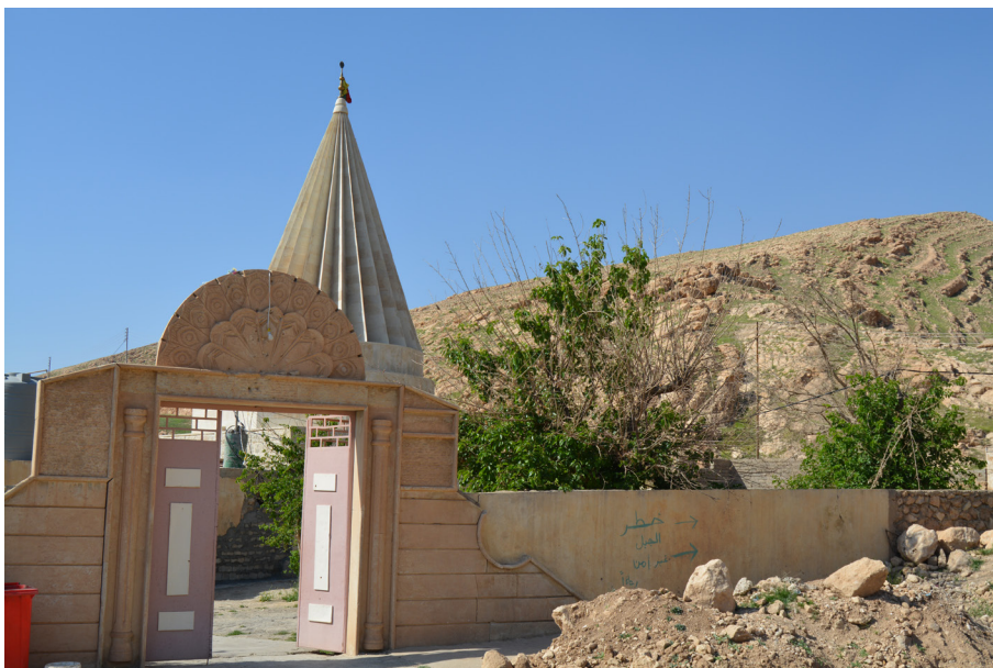
Figure 39b: The shrine of Sheikh U Bakr post-reconstruction, April 2018