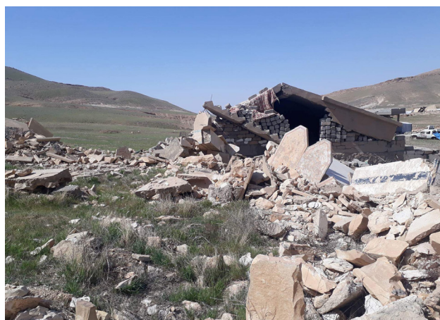
Figure 2b: The shrine of Malak Fakhraddin post-destruction, December 2018