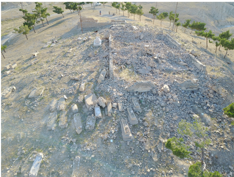
Figure 27b: The shrine of Ismaeel Bek post-destruction, June 2018