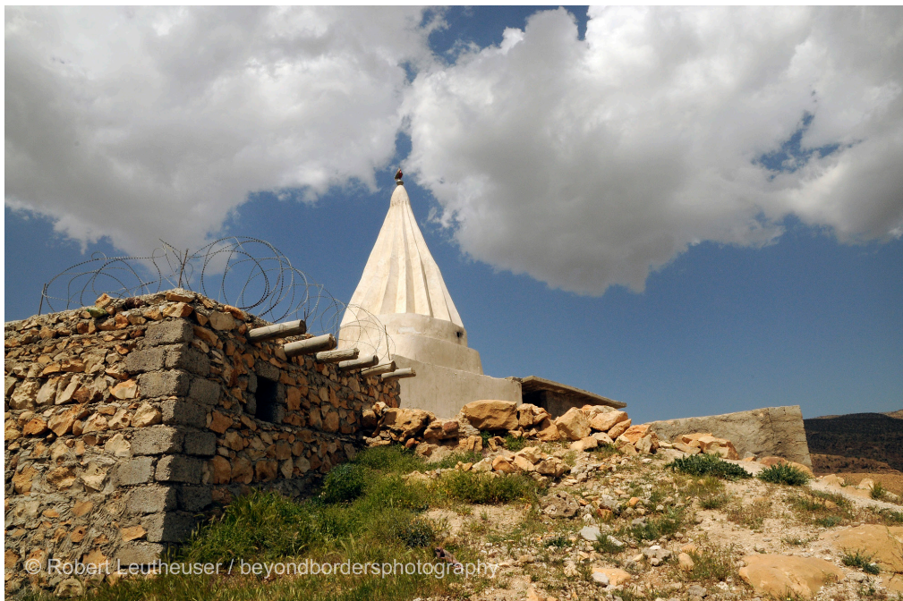
Figure 16b: The shrine of Mahma Rashan pre-destruction, October 2012