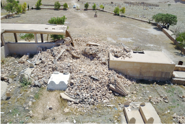
Figure 10b: The shrine of Sheikh Mand post-destruction, June 2018