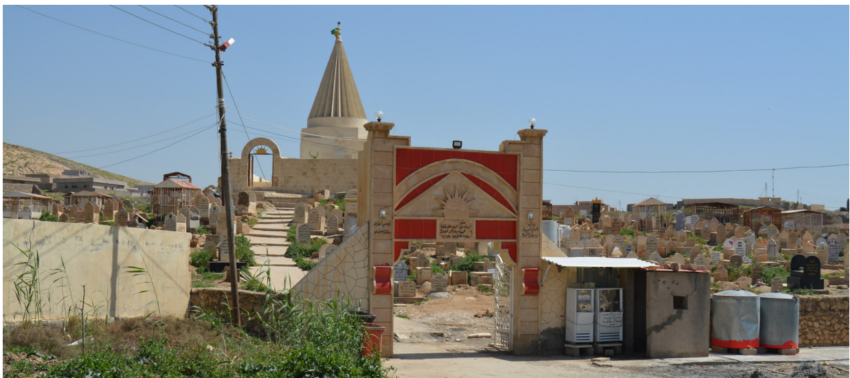
Figure 30b: The shrine of She'shems post-reconstruction, April 2018