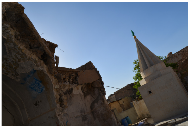
Figure 46a: The shrine of Abdi Rush post-reconstruction, April 2018