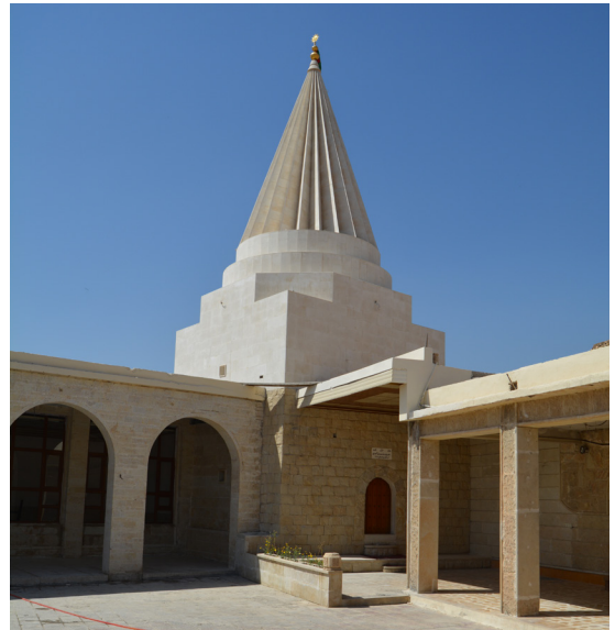
Figure 29b: The shrine of Pir Bob post-reconstruction, April 2018 (©Faris Mishko/Used With Permission)