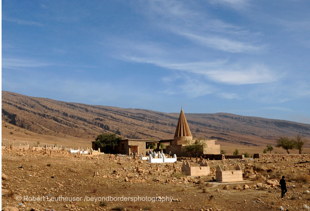
Figure 7a: The shrine of Sheikh Mand pre-destruction, October 2012