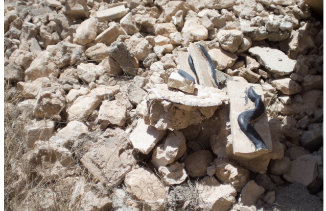
Figure 8b: The shrine of Sheikh Mand post-destruction, June 2016