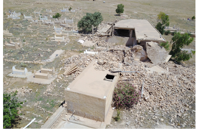
Figure 10c: The shrine of Sheikh Mand post-destruction, June 2018