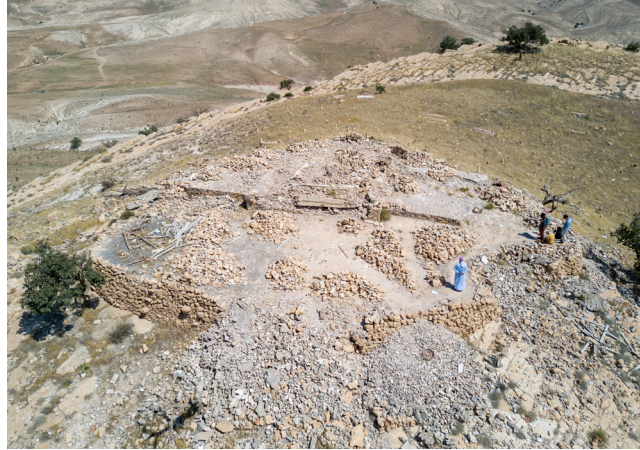
Figure 25a: The shrine of Amadin post-destruction, June 2018