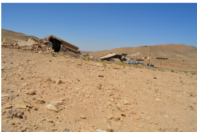
Figure 1a: The shrine of Malak Fakhraddin post-destruction, June 2018