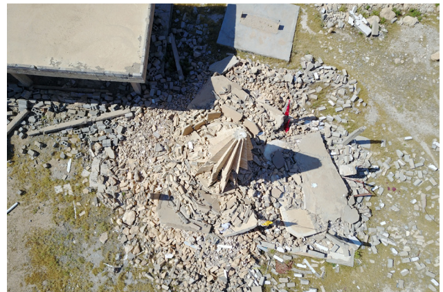
Figure 14c: The shrine of Sheikh Hassan post-destruction, June 2018