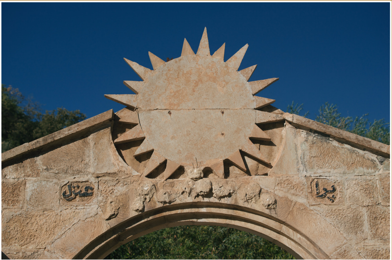
Anzal Bridge in Lalish, the holiest place in Yazidism, Duhok Governorate, September 2017