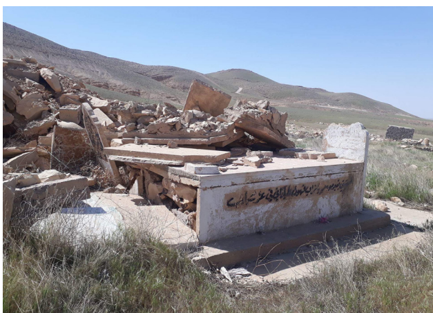
Figure 2a: The shrine of Malak Fakhraddin post-destruction, December 2018