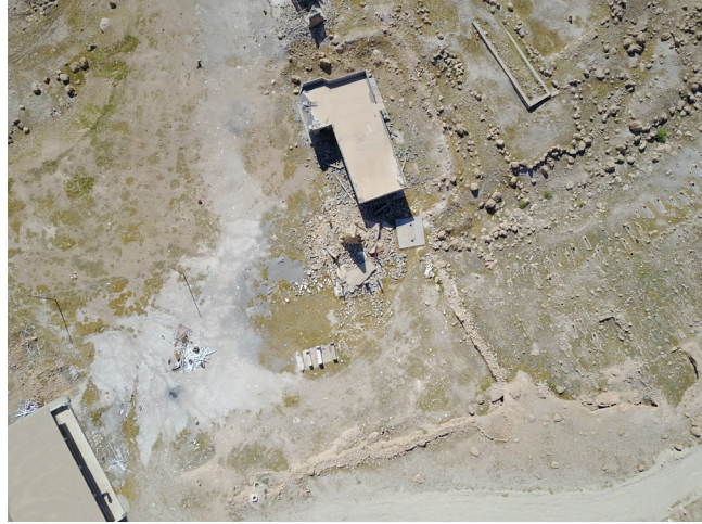
Figure 14a: The shrine of Sheikh Hassan post-destruction, June 2018