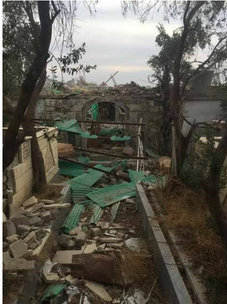
Figure 32: The shrine of Sheikh Hassan post-destruction, November 2016