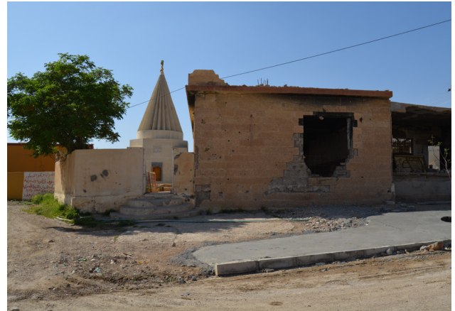
Figure 40b: The shrine of Kha'foura Reya post-reconstruction, April 2018