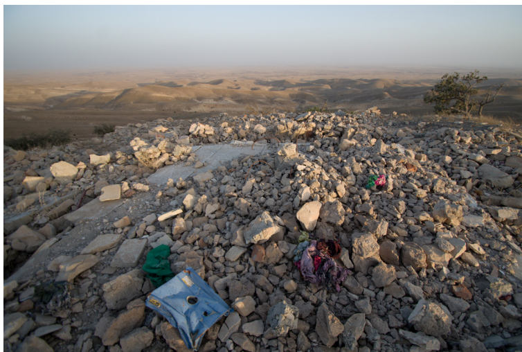
Figure 23: The shrine of Amadin post-destruction, June 2016