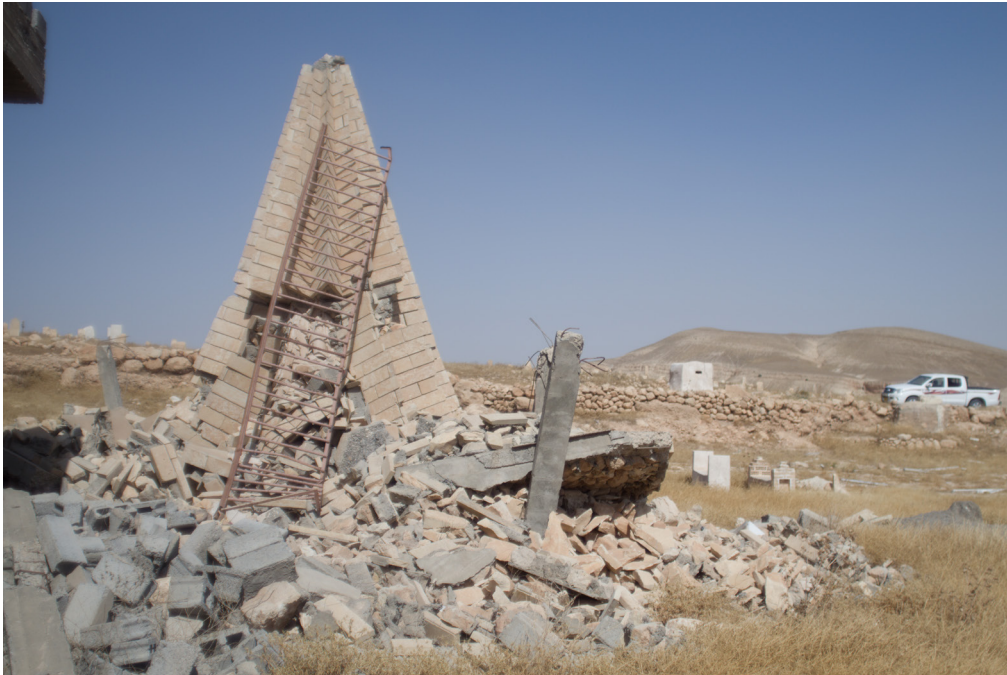
Figure 12: The shrine of Sheikh Hassan post-destruction, June 2016