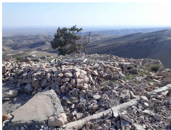
Figure 26: The shrine of Amadin post-destruction, December 2018