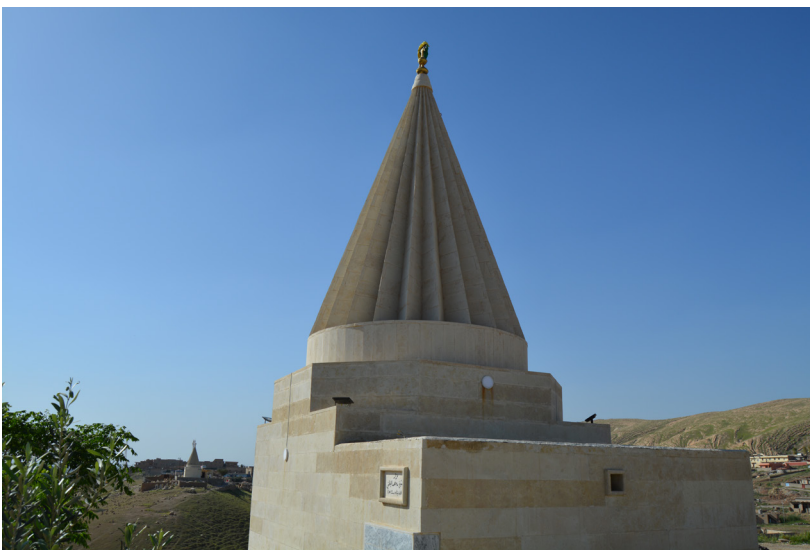
Figure 44a: The shrine of Mahamad Batin post-reconstruction, April 2018