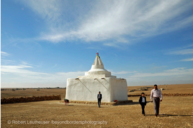
Figure 3a: The shrine of Sheikh Abdul Qader pre-destruction, October 2012