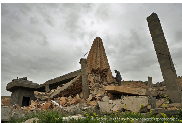
Figure 13a: The shrine of Sheikh Hassan post-destruction, April 2017