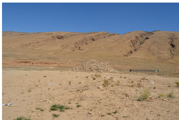
Figure 1b: The shrine of Malak Fakhraddin post-destruction, June 2018