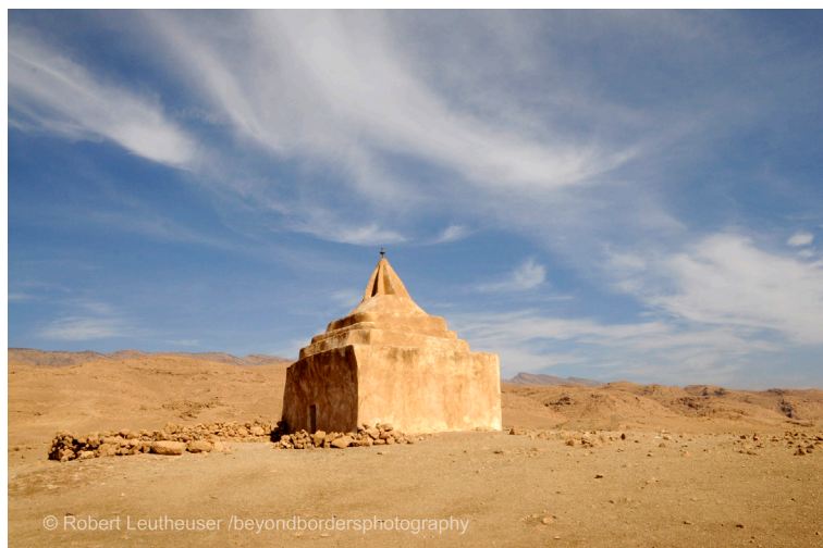
Figure 5b: The shrine of Sheikh Abdul Aziz pre-destruction, October 2012