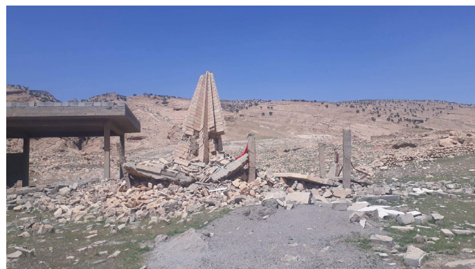
Figure 15: The shrine of Sheikh Hassan post-destruction, December 2018