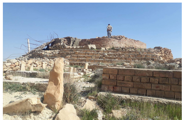
Figure 21: The shrine of Mahma Rashan post-destruction, December 2018