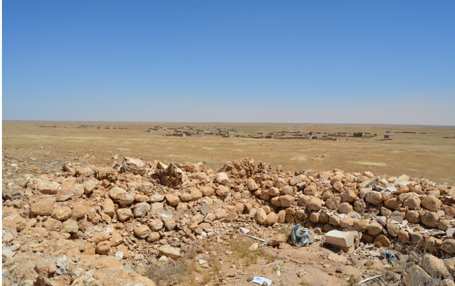
Figure 6a: The shrine of Sheikh Abdul Aziz post-destruction, June 2018