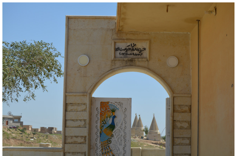
Figure 33b: The shrine of Sheikh Hassan post-reconstruction, April 2018