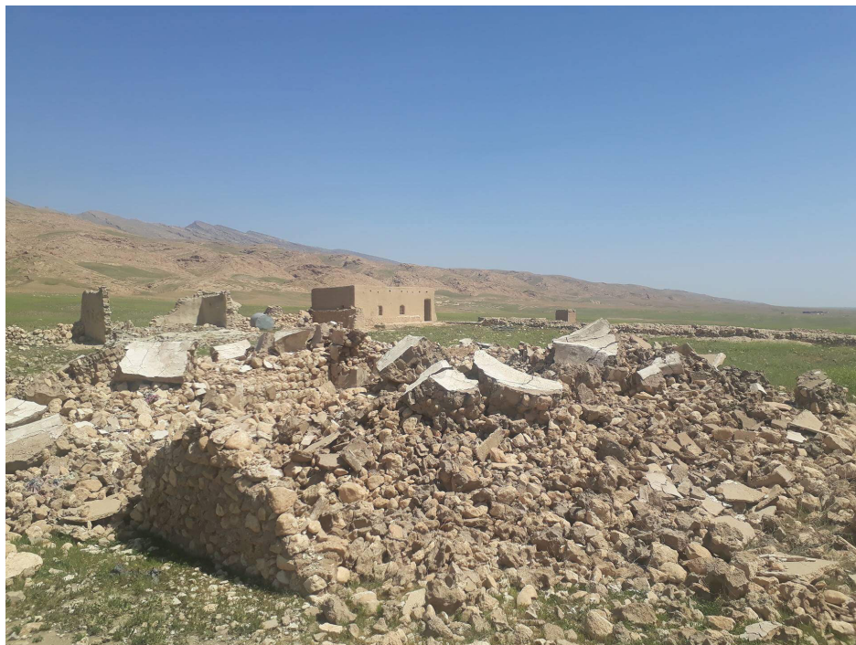
Figure 4: The shrine of Sheikh Abdul Qader post-destruction, December 2018