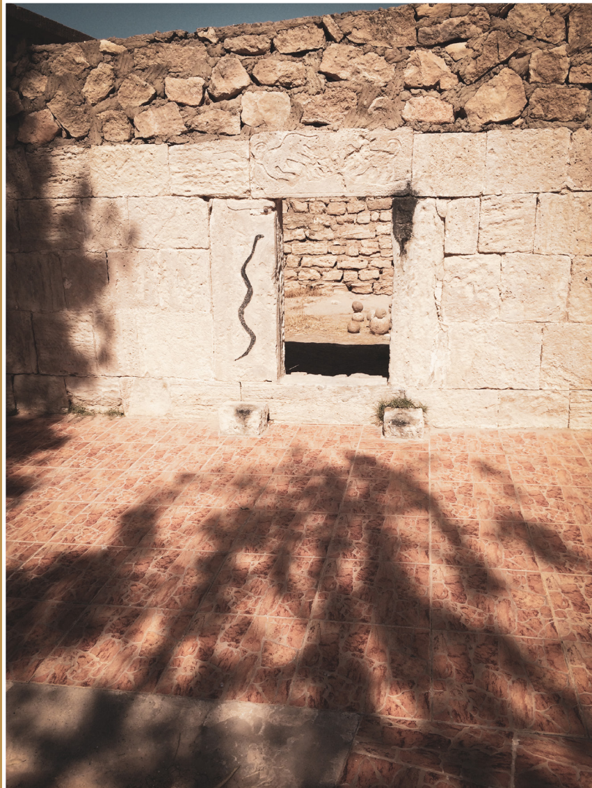
Entrance to the sacred part of the shrine at Khanek, Duhok Province