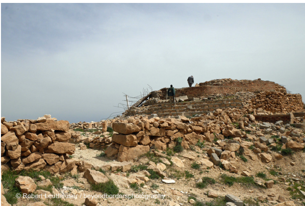
Figure 18a: The shrine of Mahma Rashan post-destruction, April 2017