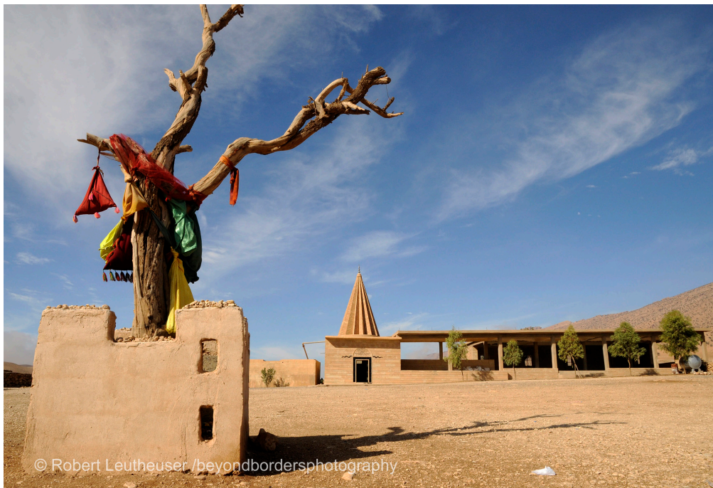
Figure 7b: The shrine of Sheikh Mand pre-destruction, October 2012