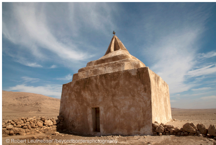
Figure 5a: The shrine of Sheikh Abdul Aziz pre-destruction, October 2012