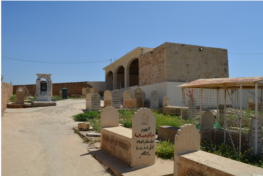
Figure 34a: The shrine of Malak Naserddin post-reconstruction, April 2018