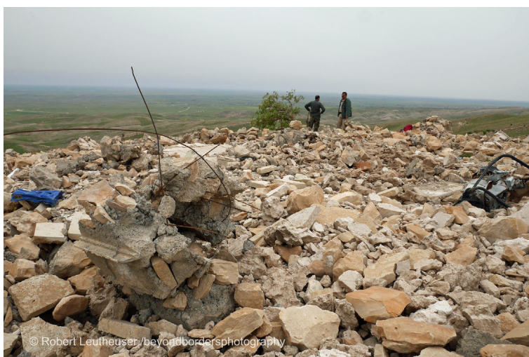
Figure 24a: The shrine of Amadin post-destruction, April 2017