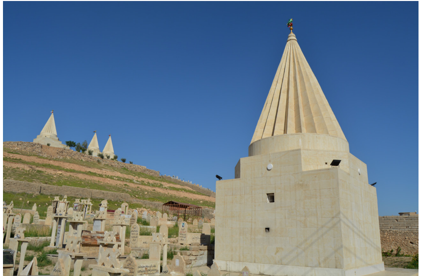
Figure 42b: The shrine of Sheikh Babek post-reconstruction, April 2018