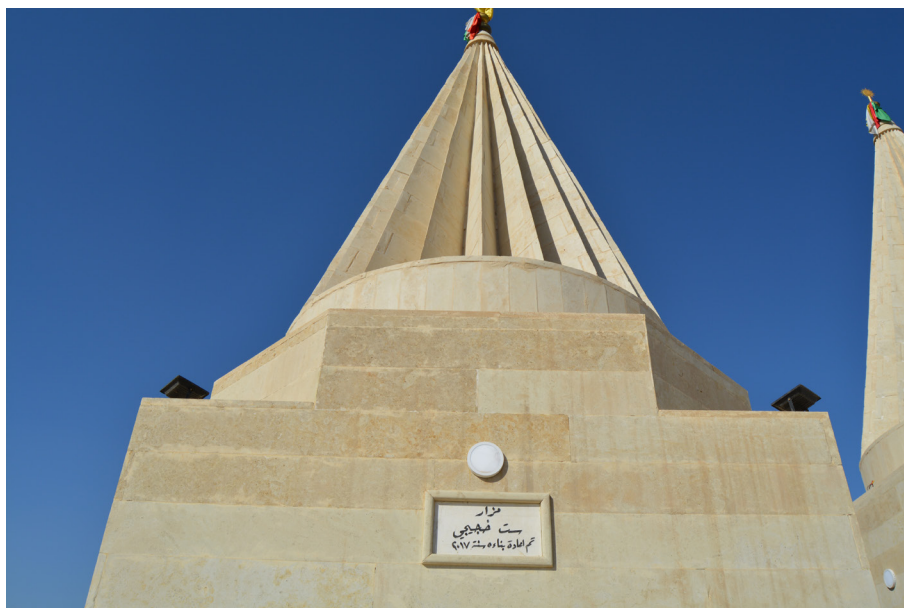
Figure 45b: The shrine of Stiya Khaji post-reconstruction, April 2018