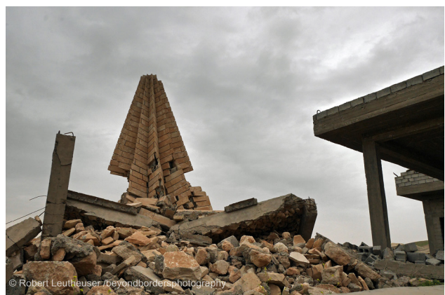
Figure 13b: The shrine of Sheikh Hassan post-destruction, April 2017