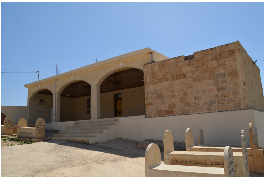
Figure 34b: The shrine of Malak Naserddin post-reconstruction, April 2018