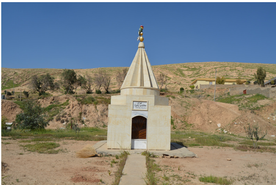
Figure 38b: The shrine of Gava'ni Zar'za post-reconstruction, April 2018