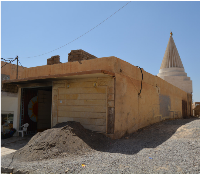
Figure 29a: The shrine of Pir Bob post-reconstruction, April 2018