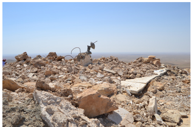
Figure 25c: The shrine of Amadin post-destruction, June 2018