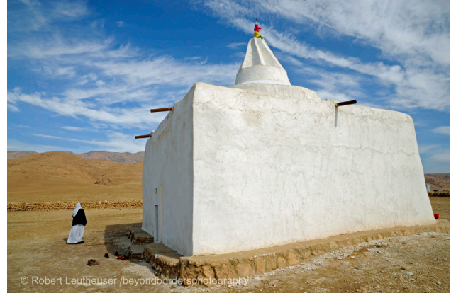
Figure 3b: The shrine of Sheikh Abdul Qader pre-destruction, October 2012