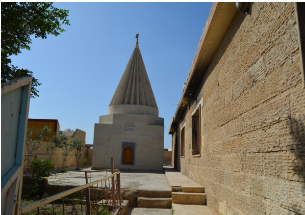
Figure 40a: The shrine of Kha'foura Reya post-reconstruction, April 2018