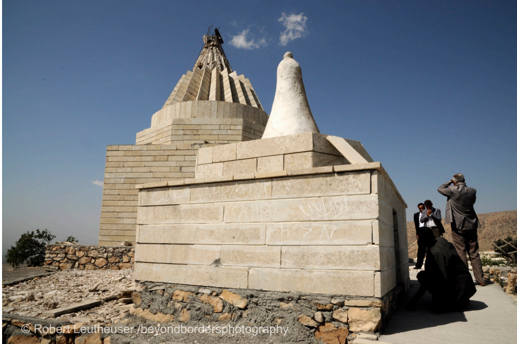
Figure 22a: The shrine of Amadin pre-destruction, October 2012