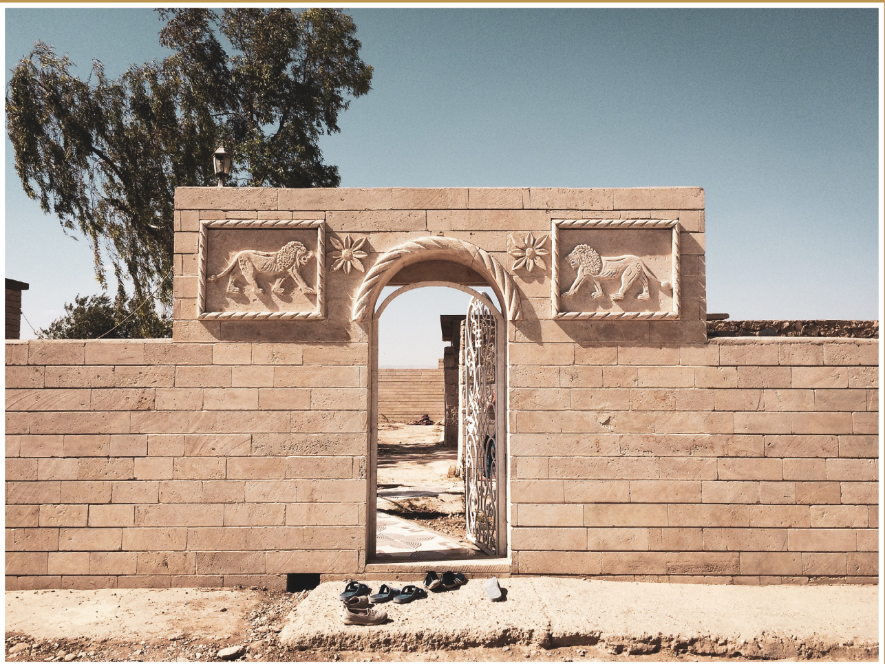
Main entrance to the shrine in Khanek, Dohuk Governorate, June 2017