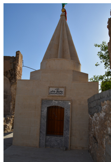
Figure 46b: The shrine of Abdi Rush post-reconstruction, April 2018