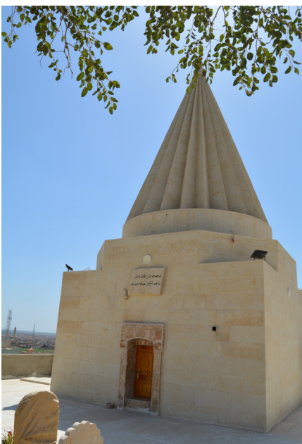
Figure 33a: The shrine of Sheikh Hassan post-reconstruction, April 2018