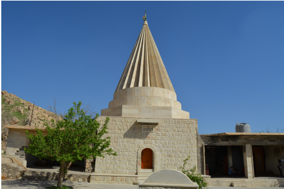
Figure 39a: The shrine of Sheikh U Bakr post-reconstruction, April 2018