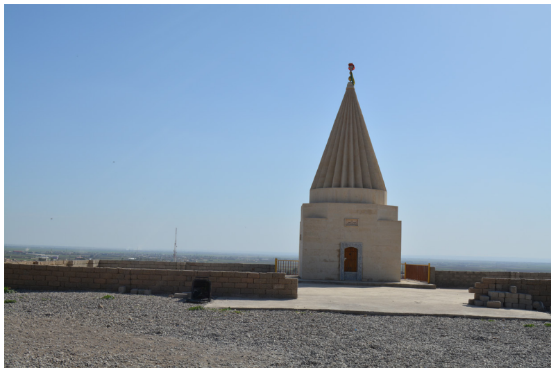
Figure 41b: The shrine of Seed u Mas'ud post-reconstruction, April 2018