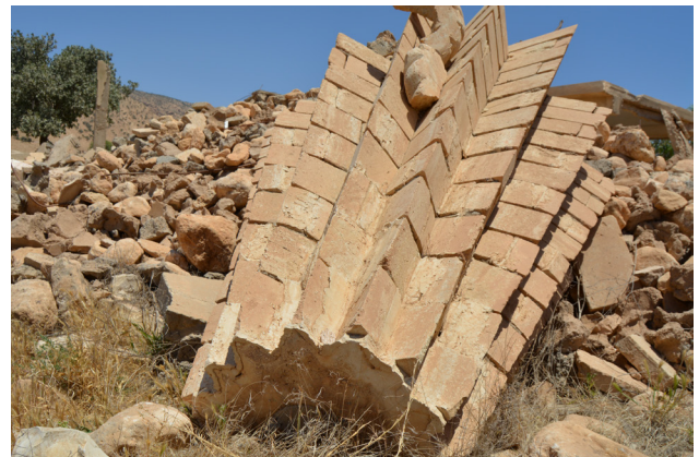
Figure 10e: The shrine of Sheikh Mand post-destruction, June 2018