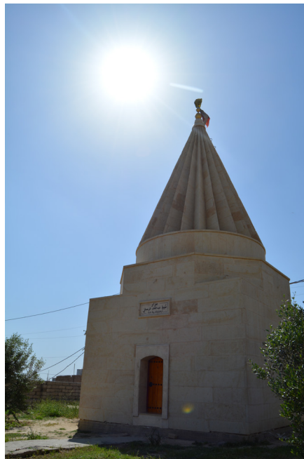
Figure 36a: The shrine of Sheikh Abdul Qader post-reconstruction, April 2018