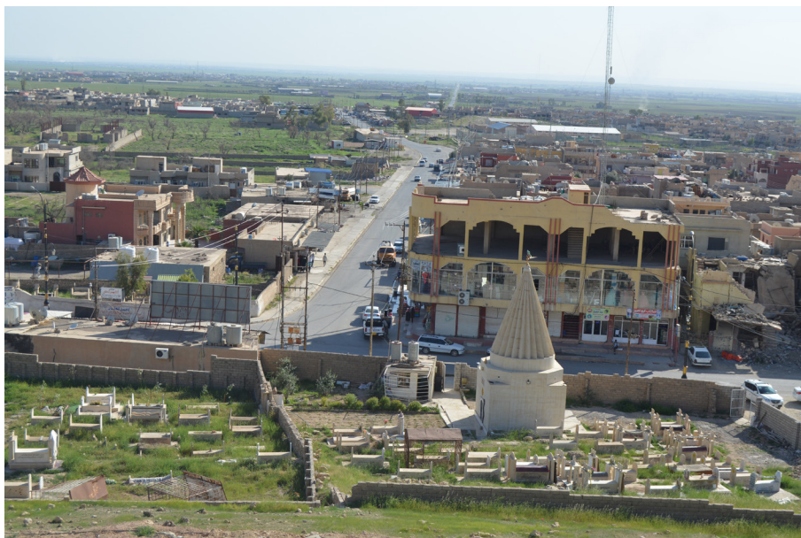
Figure 42c: The shrine of Sheikh Babek post-reconstruction, April 2018