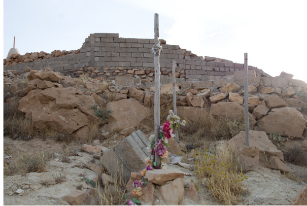
Figure 17: The shrine of Mahma Rashan post-destruction, June 2016