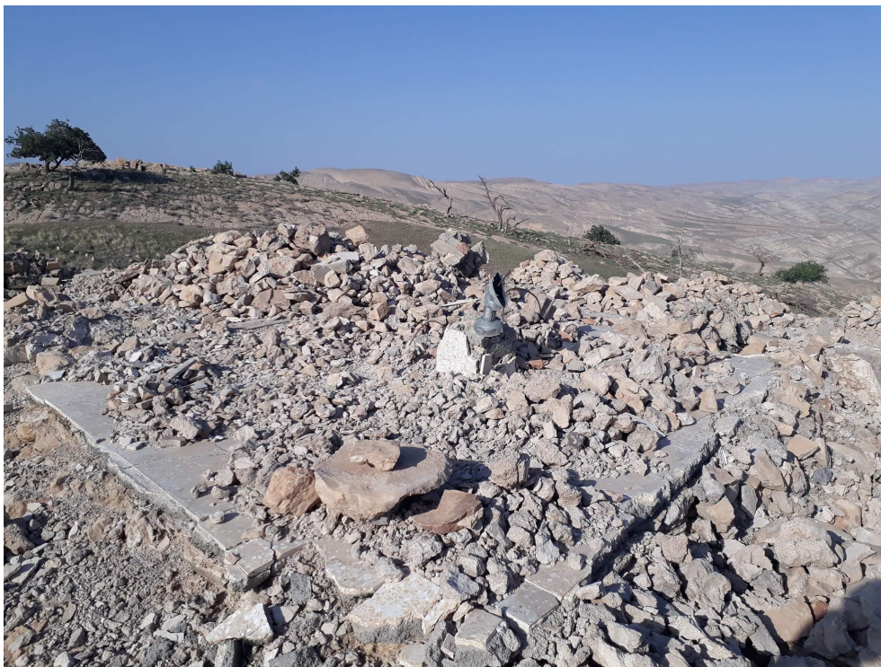
Figure 28: The shrine of Ismaeel Bek post-destruction, December 2018