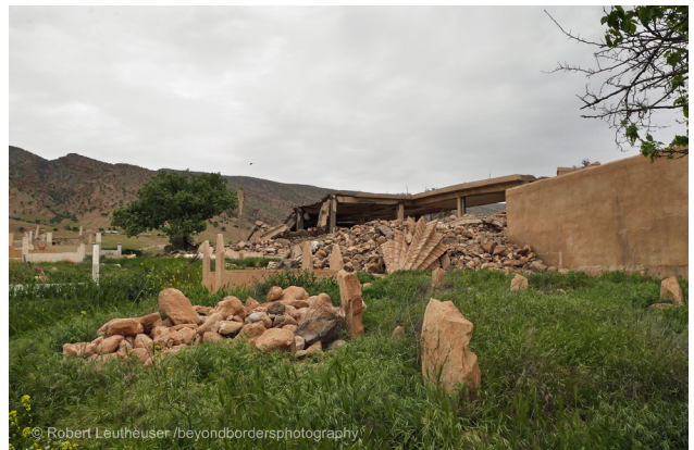
Figure 9b: The shrine of Sheikh Mand post-destruction, April 2017