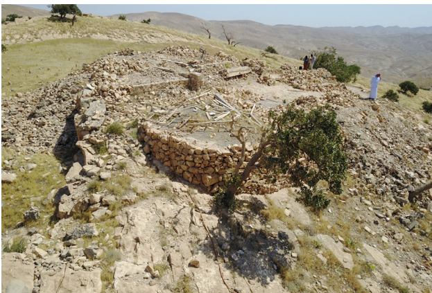
Figure 25b: The shrine of Amadin post-destruction, June 2018