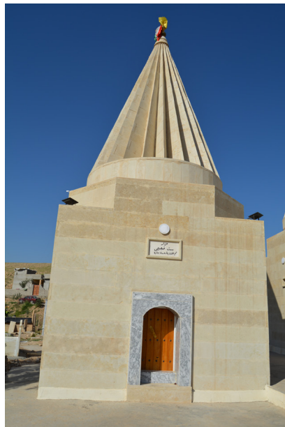
Figure 45a: The shrine of Stiya Khaji post-reconstruction, April 2018