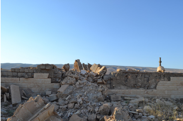
Figure 27c: The shrine of Ismaeel Bek post-destruction, June 2018