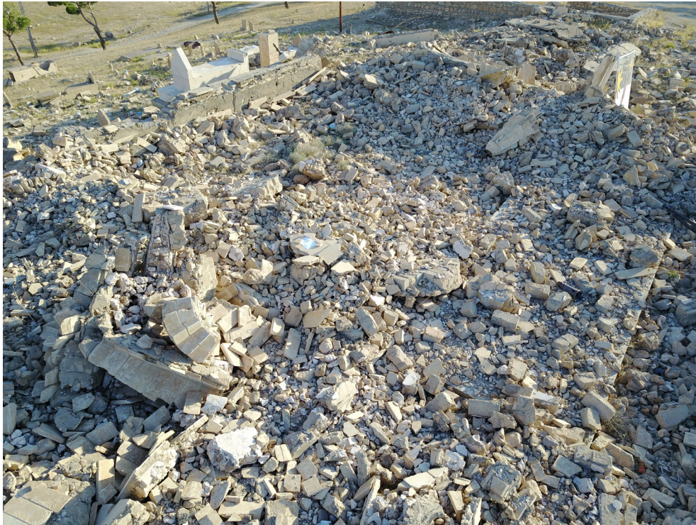
Figure 27a: The shrine of Ismaeel Bek post-destruction, June 2018