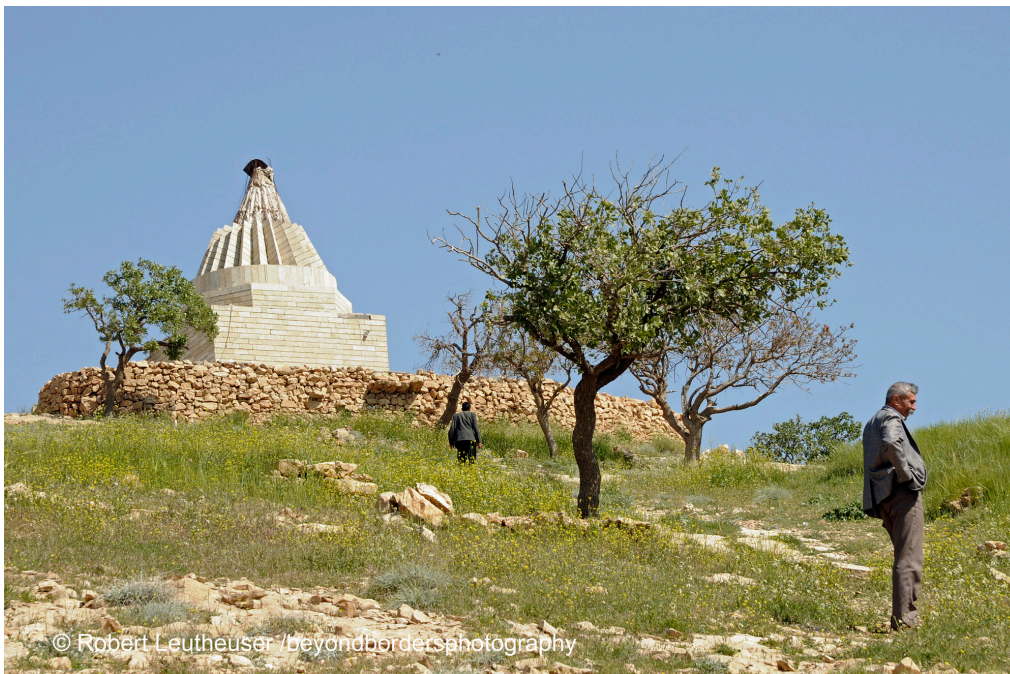
Figure 22b: The shrine of Amadin pre-destruction, October 2012