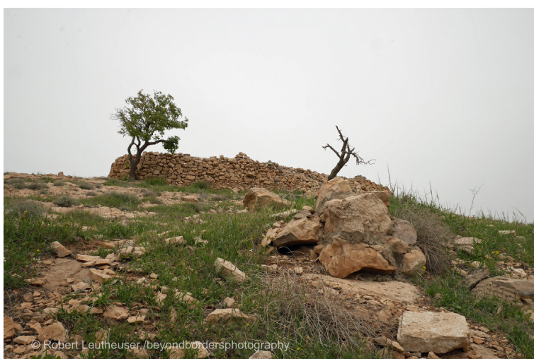
Figure 24b: The shrine of Amadin post-destruction, April 2017