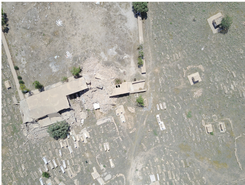
Figure 10a: The shrine of Sheikh Mand post-destruction, June 2018