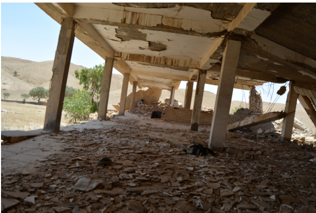
Figure 10d: The shrine of Sheikh Mand post-destruction, June 2018