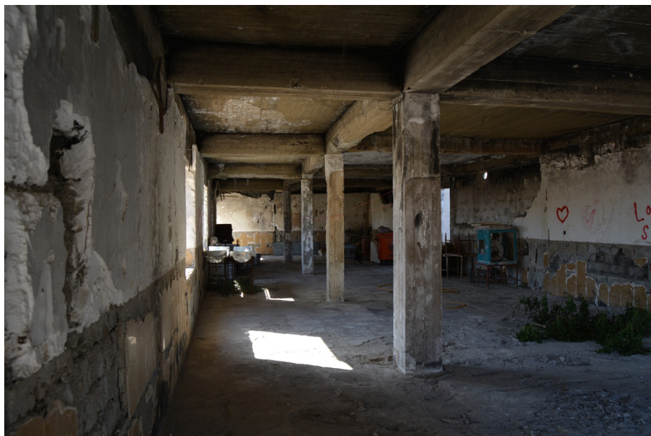
Figure 40c: The shrine of Kha'foura Reya post-reconstruction, April 2018