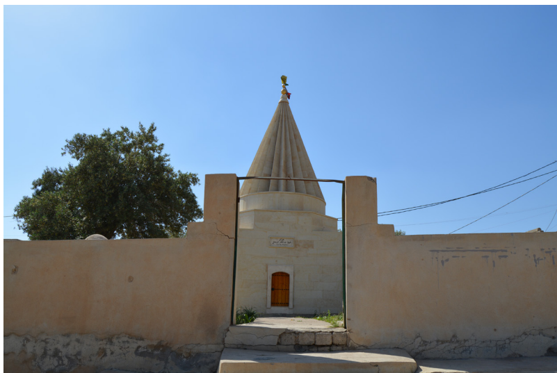
Figure 37b: The shrine of Sheikh Abdul Qader post-reconstruction, April 2018