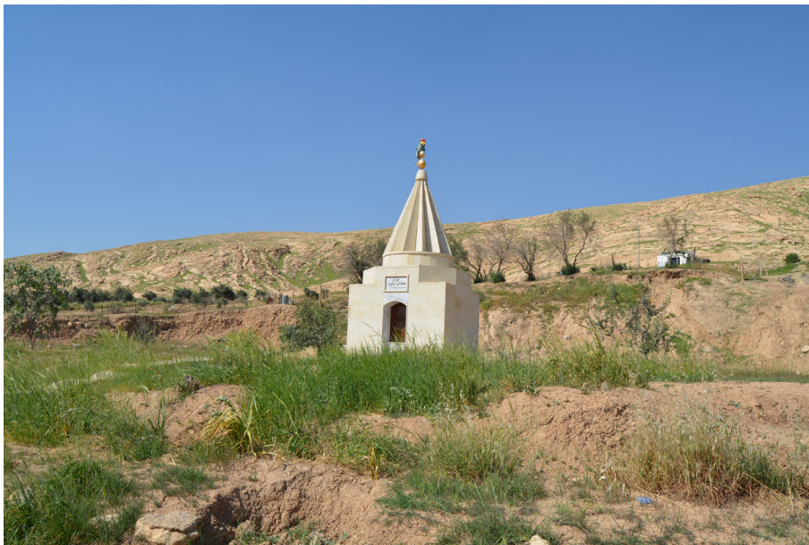
Figure 38a: The shrine of Gava'ni Zar'za post-reconstruction, April 2018