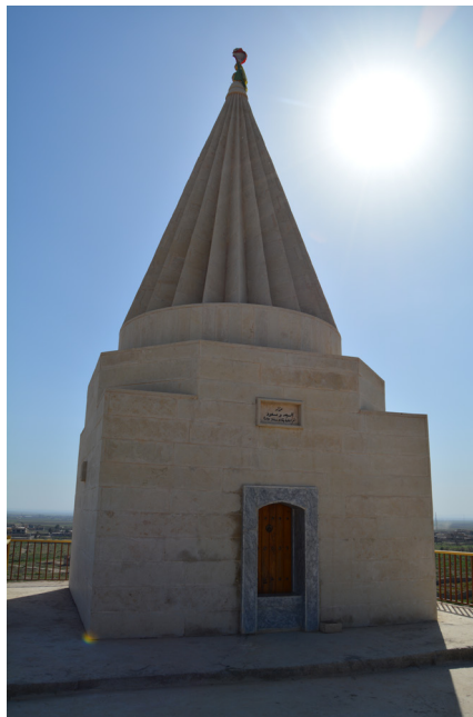
Figure 41a: The shrine of Seed u Mas'ud post-reconstruction, April 2018