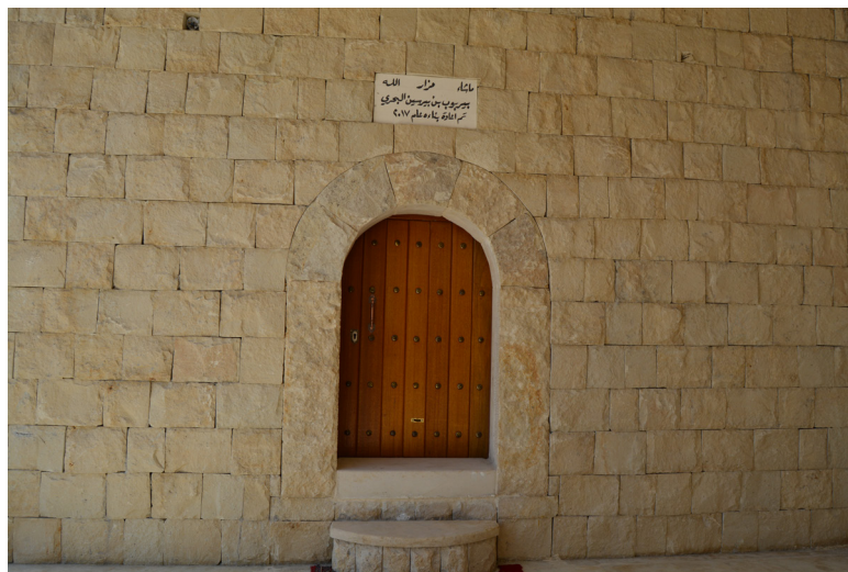
Figure 29c: The shrine of Pir Bob post-reconstruction, April 2018