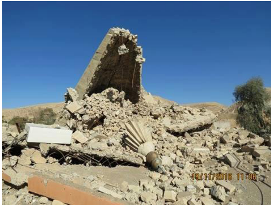
Figure 43: The shrine of Mahamad Batin post-destruction, November 2016