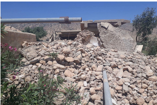
Figure 11a: The shrine of Sheikh Mand post-destruction, December 2018