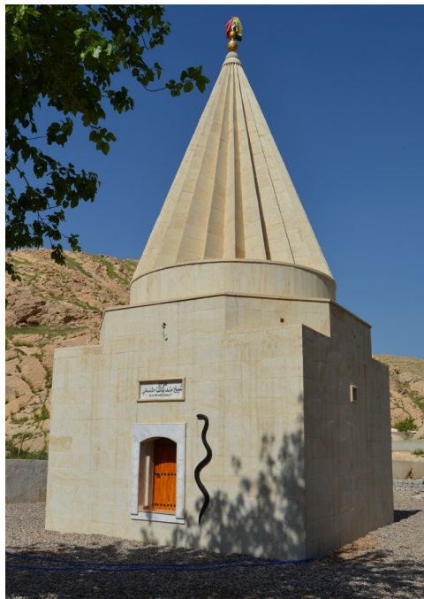
Figure 35a: The shrine of Sheikh Mand post-reconstruction, April 2018