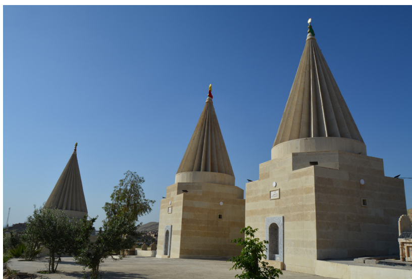
Figure 48a: The shrine of Stiya Habib (foreground) post-reconstruction, April 2018 (shrines of Stiya Khaji and Mahamad Batin in background)