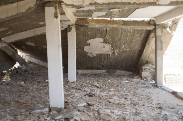
Figure 8a: The shrine of Sheikh Mand post-destruction, June 2016