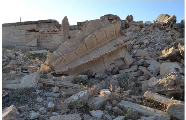
Figure 27d: The shrine of Ismaeel Bek post-destruction, June 2018