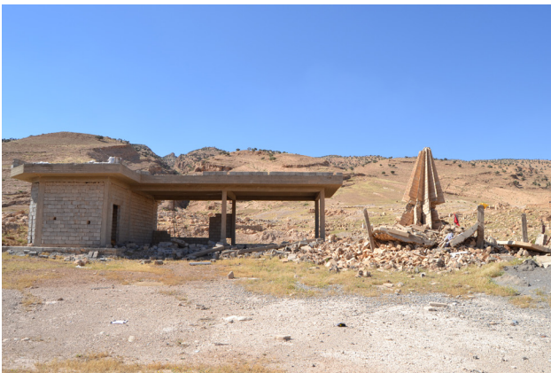
Figure 14b: The shrine of Sheikh Hassan post-destruction, June 2018