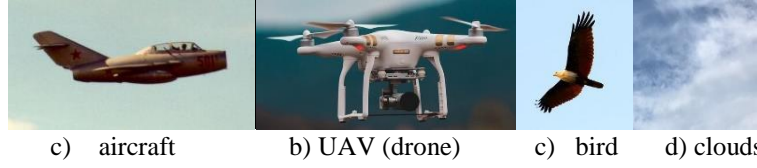
Fig. 2. Examples of images collected from the internet (DS-2) to train the classification system.