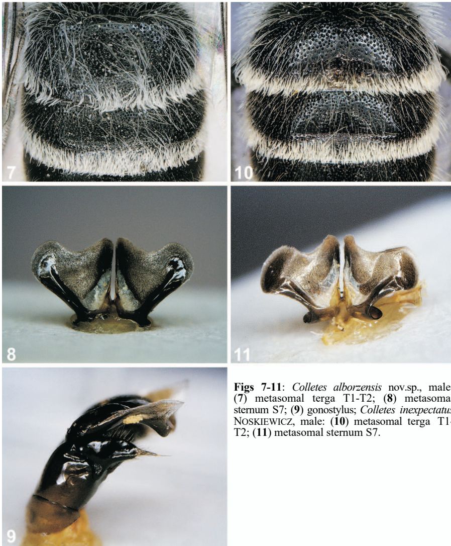
Figs 7-11: Colletes alborzensis nov.sp., male: (7) metasomal terga T1-T2; (8) metasomal sternum S7; (9) gonostylus; Colletes inexpectatus NOSKIEWICZ, male: (10) metasomal terga T1-T2; (11) metasomal sternum S7.