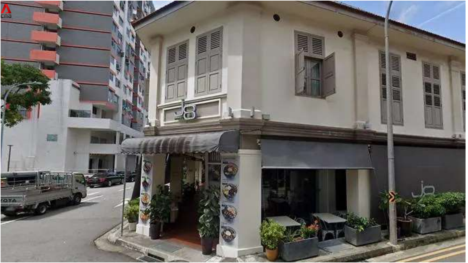
Screengrab from Google Maps of J8 Hotel in Singapore.

She had also used public transport in Singapore, including the MRT and taxis.