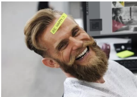
Motley Fool Issues Rare "All In" Buy Alert The Motley Fool