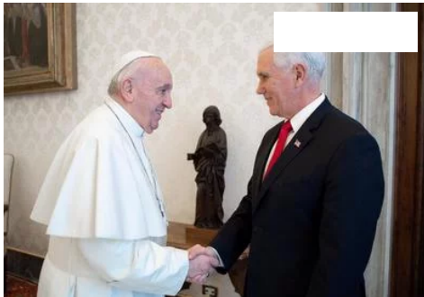
Pence to Pope Francis: 'You have made me a hero'