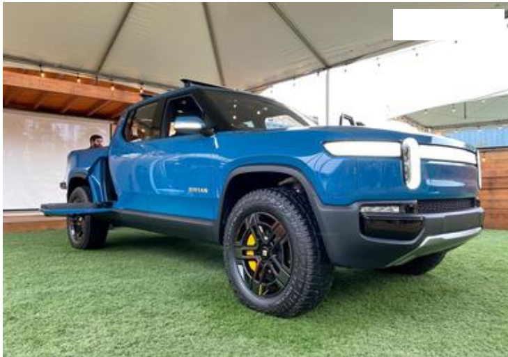
Electric vehicle maker Rivian: expect prices lower than previously...