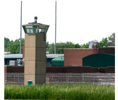
About 3,100 federal inmates released early under new U.S.