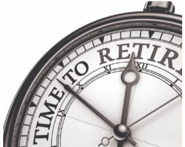
Find Out When to Retire With These Simple Fisher Investments