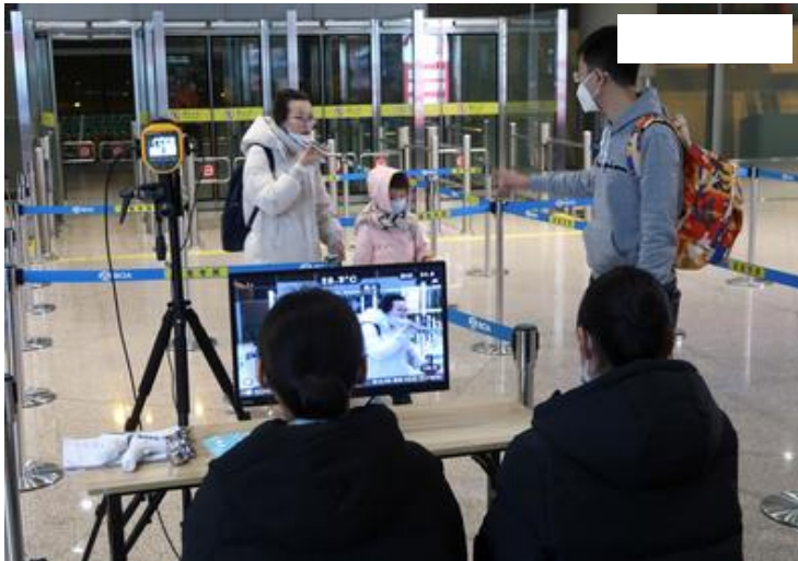
China scrambles to contain 'strengthening' virus