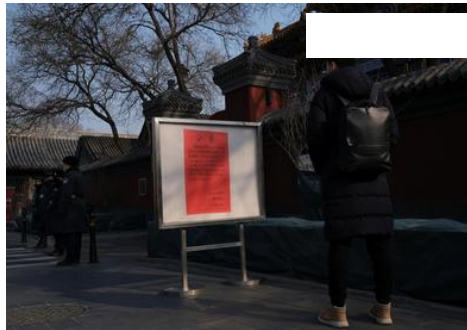
Latest on the coronavirus spreading in China and beyond