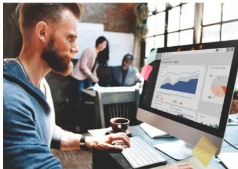
Learn the 5 easy steps to start buying stocks NerdWallet