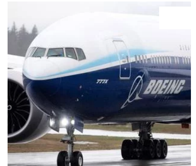
Boeing's 777X jetliner successfully completes maiden flight