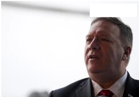
Pompeo accuses radio reporter of "shameful" lying after testy...