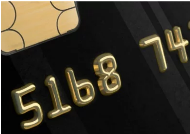
Top 10 Balance Transfer Credit Cards of 2020 CompareCards.com