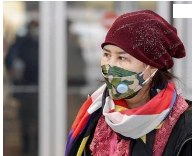
U.S. to evacuate its citizens from Wuhan, China - V