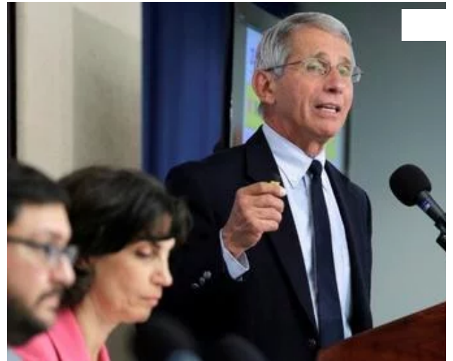
With Wuhan virus genetic code in hand, scientists work on a...