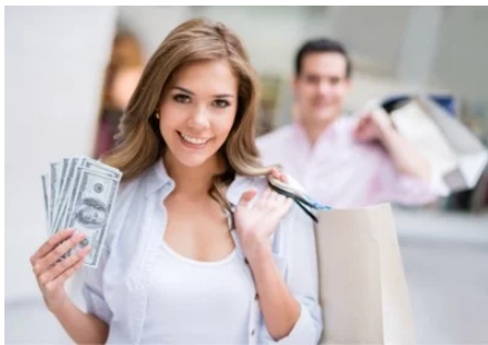
The Highest Paying Cash Back Card Of 2020 Has Hit The Market WiseBread.com