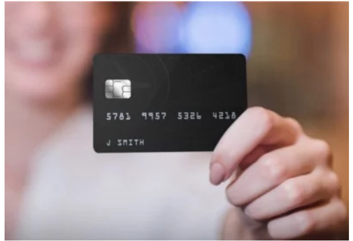
Top 9 Balance Transfer Credit Cards of 2020 CompareCards.com