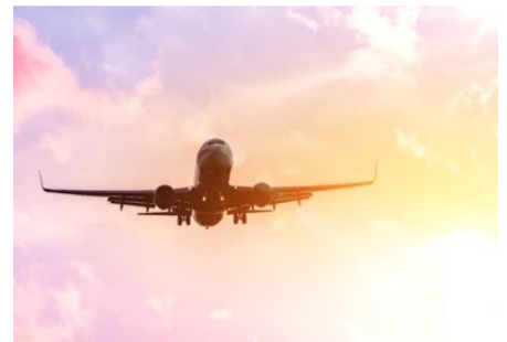
Best Travel Cards of 2020 - All With No Annual Fee CompareCards.com