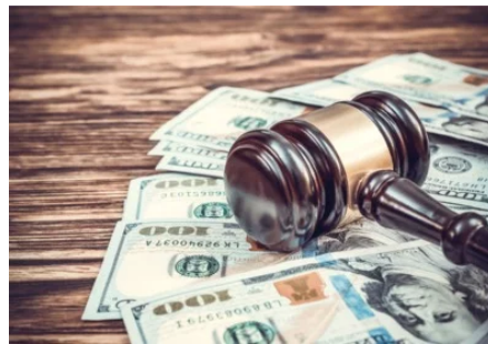
The highest cash back card on the market? The Ascent