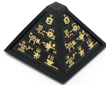
Figure 1: An early prototype of the grain prism instrument.

The Grain Prism is inspired by these two movements. It allows the player to record and manipulate audio samples, and seed a digital granular synthesis patch. The pyra-