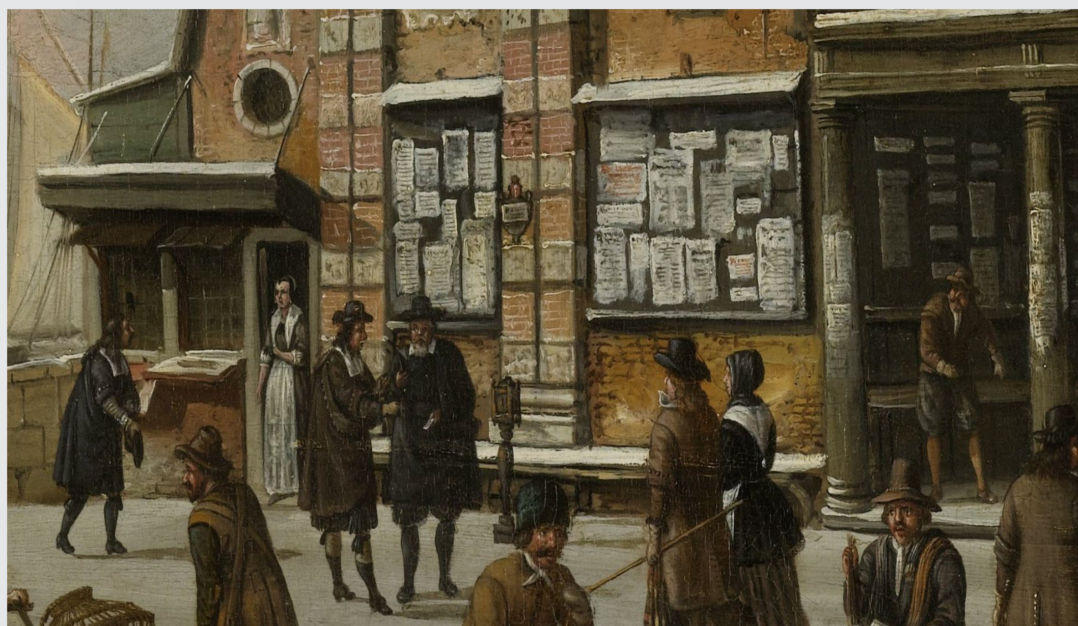
Early modern ordinances affixed to 'known places' and proclaimed by the city crier. (Paalhuis c.1660).

The project uses printed books of ordinances from the Low Countries (1500-1800s) to answer this hypothesis.