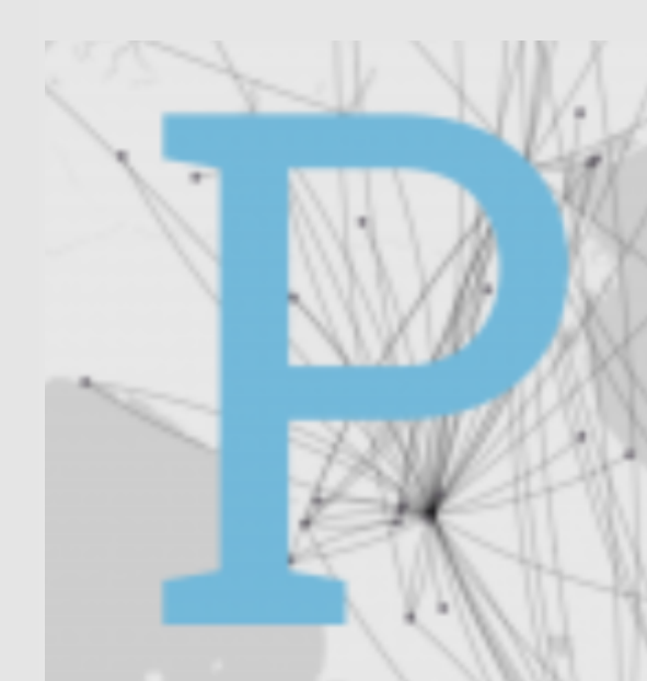
e.g. Palladio - Stanford