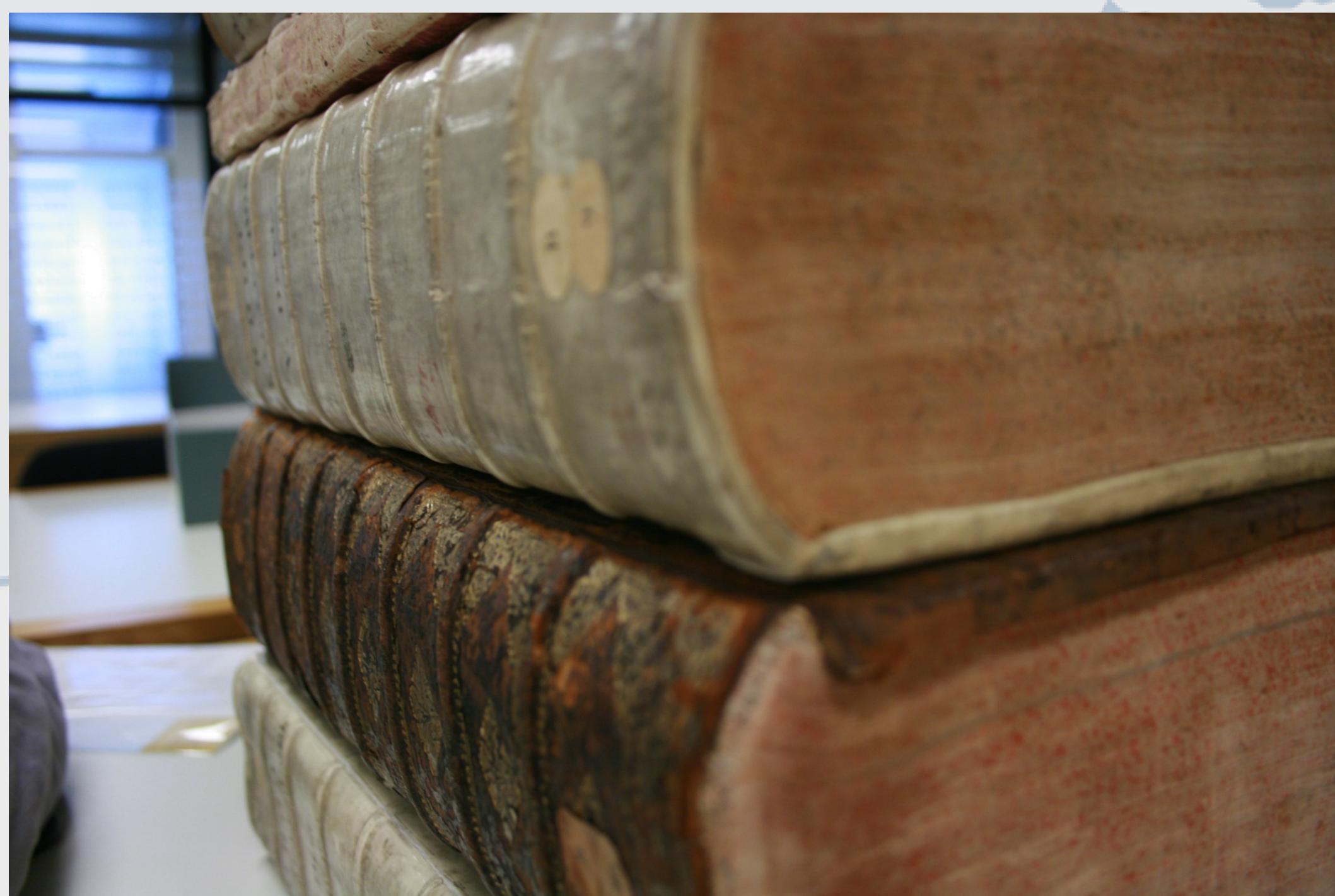
Each of the provinces collected their (most) important ordinances in 'books of ordinances', these are now digitised and available online.