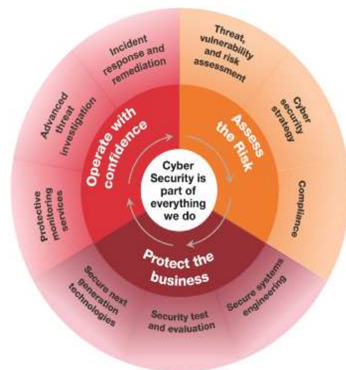
Fig. 2: Depicted the Fundamentals of Cyber Security and Allied affairs

and information systems by ensuring their availability, integrity, authentication, confidentiality, and non-repudiation. These measures include providing for restoration of information systems by incorporating protection, detection, and reaction capabilities. Information Assurance is very close with the IT Security and IT Security is close with Cyber Security. The Cyber Security with its fundamentals is depicted in Fig: 2 in brief.