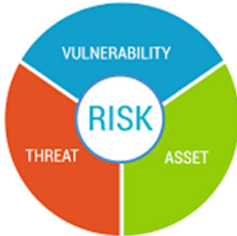
Fig. 1: Core facets of Vulnerability

Assurance, Vulnerability is an important and emerging concept.